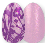
Spread Your Wings nail art glitter