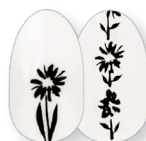
Made My Daisy nail art clear overlay