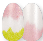
To Dye For nail art shimmer