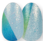
Waterfall's Edge nail art shimmer