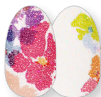
Avant Garden nail art prism FX