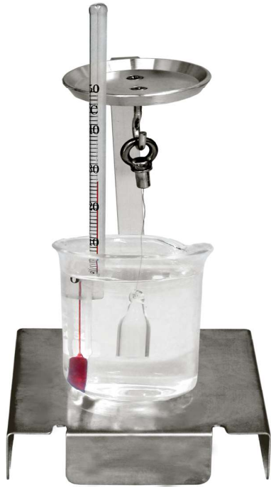
WDK200 DENSITY KIT