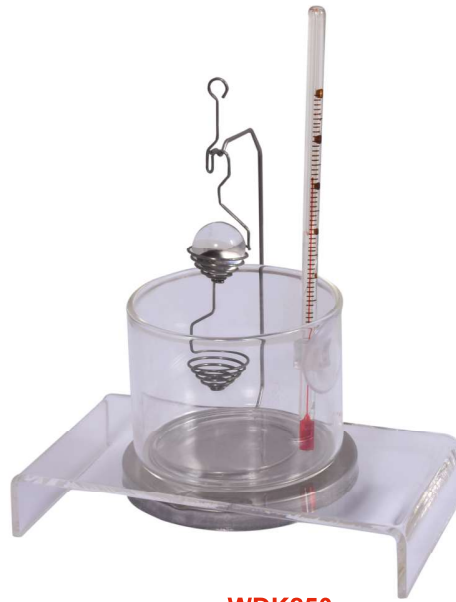
WDK250 DENSITY KIT