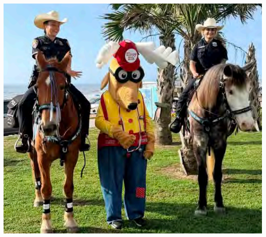
Galveston Elks DAP committee joined the Out If The Darkness walk by AFSP for suicide prevention. We are happy to partner with great community organizations.