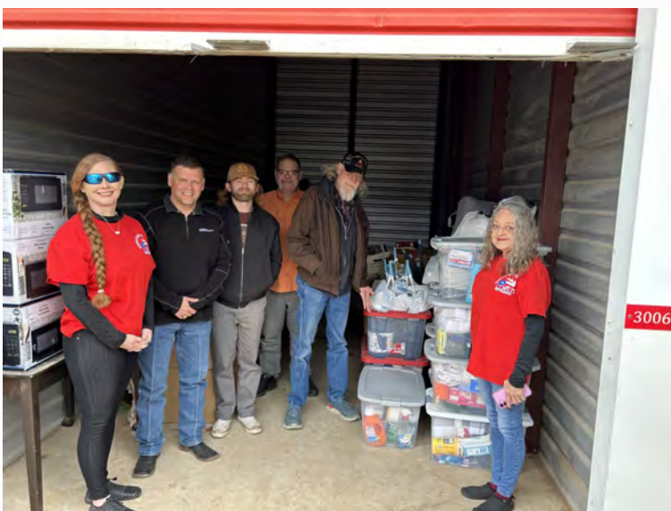
Amarillo Lodge 923 used the Gratitude Grant to help support Veterans with supplemental Welcome Home Kit supplies including hygiene items and home goods.