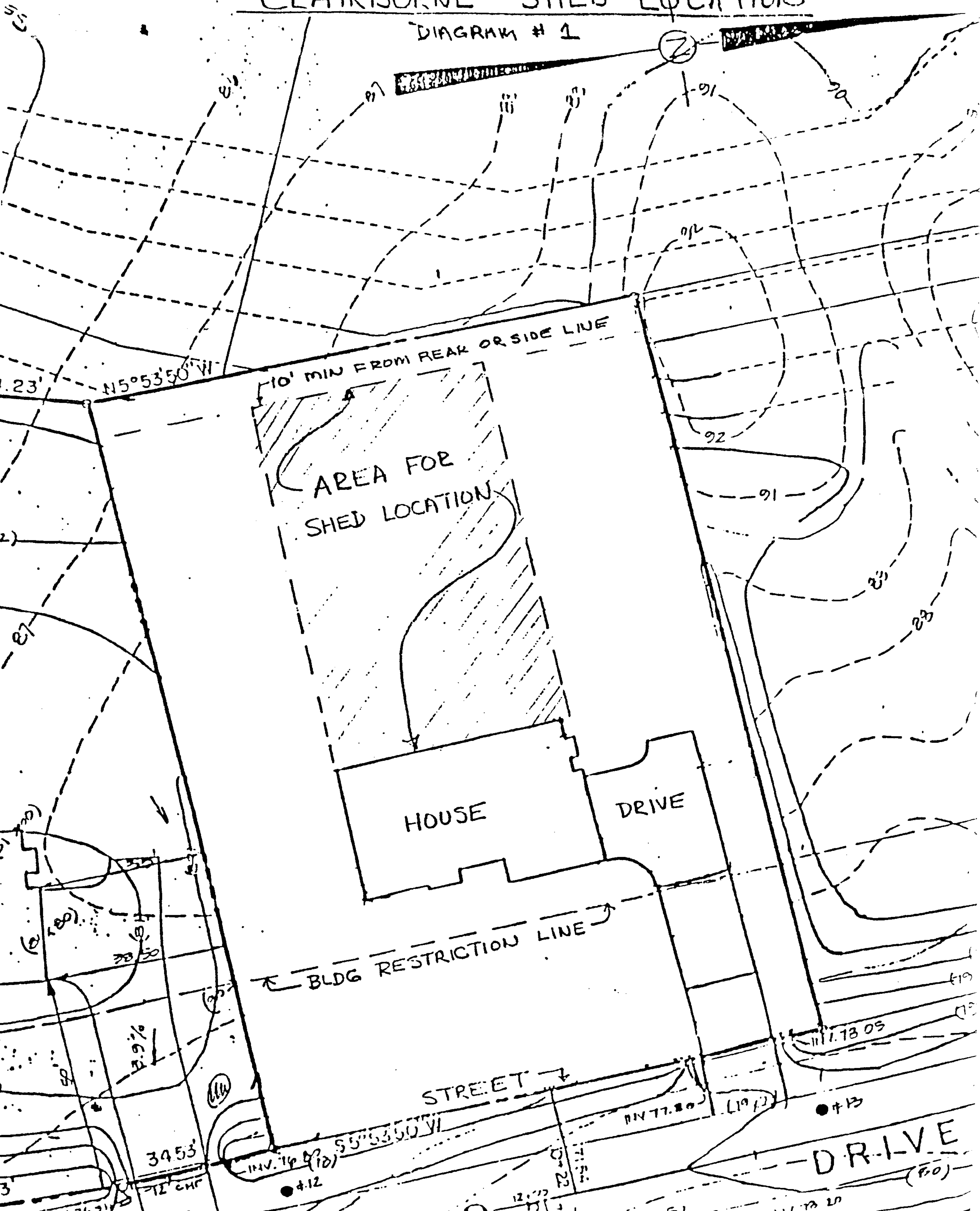
DIAGRAM # 1