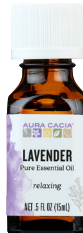
Aura Cacia Lavender Essential Oil

From self-care to home care, our 100% pure essential oils, skincare, bath, and home care products bring the beauty of nature into every part of your day.