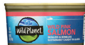
Wild Planet Wild Pink Salmon selected varieties