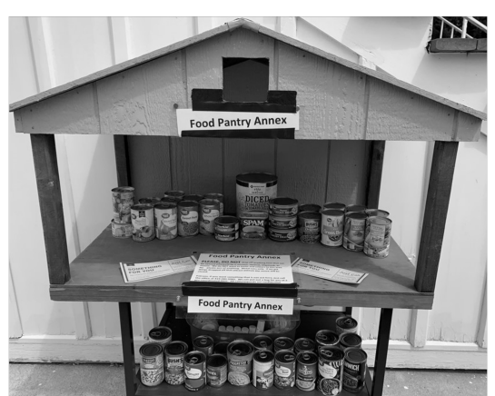
Put-in-Bay Food Pantry adapted to COVID concerns by offering an outdoor Annex.