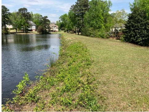
Front of dam