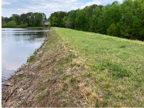
Front of dam