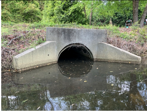
Inlet 3 with pipe damage

Fountain/Aerator Condition: N/A= Not Applicable