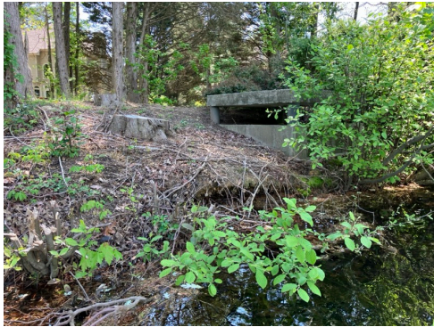
Riser and erosion