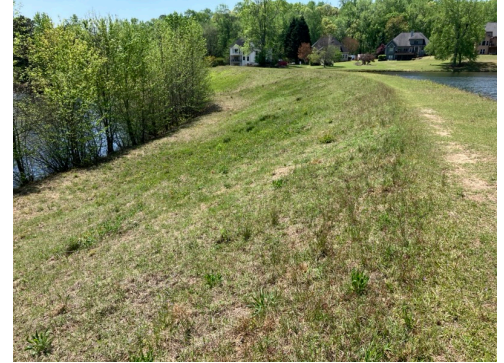
Back of dam