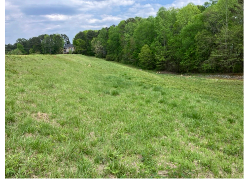
Back of dam