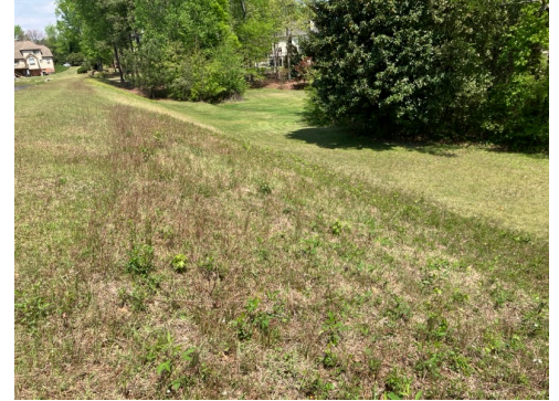
Back of dam