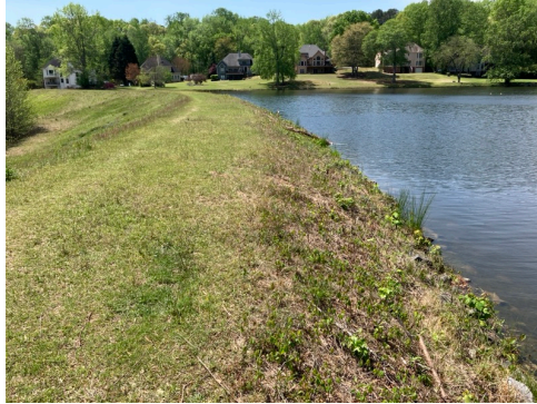
Front of dam