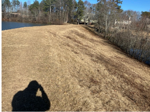
Back of dam