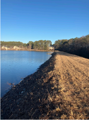
Front of dam

Fountain/Aerator Condition: N/A= Not Applicable