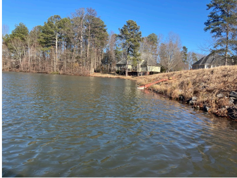
Front of dam

Fountain/Aerator Condition: N/A= Not Applicable