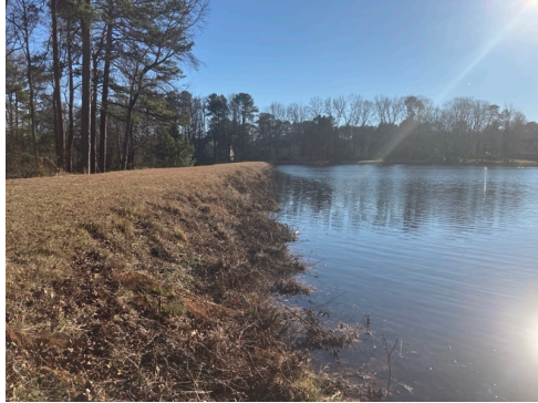
Front of dam