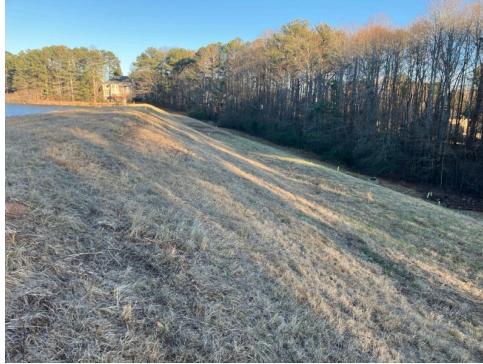
Back of dam