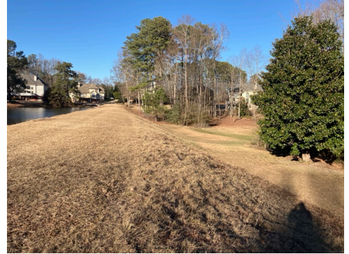
Back of dam