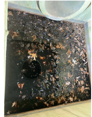
Inside of riser