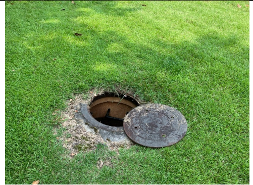
Lake 2 Ocs