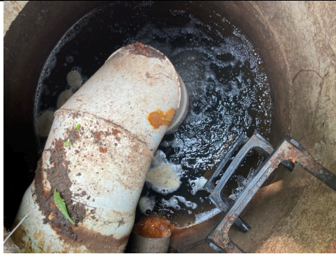
Lake 1 Ocs