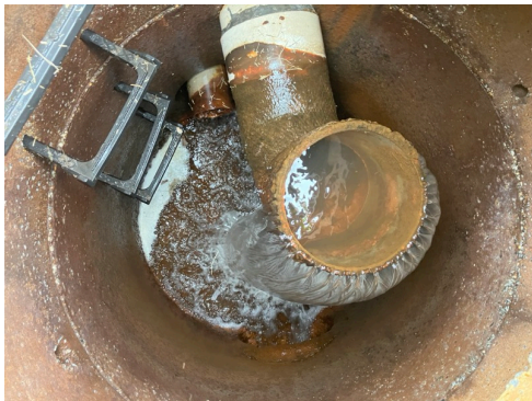
Lake 2 Ocs