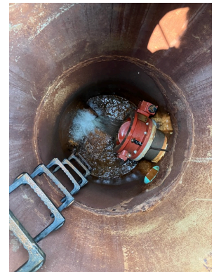
Lake 3 valve