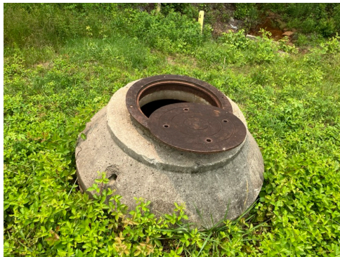
Lake 3 valve