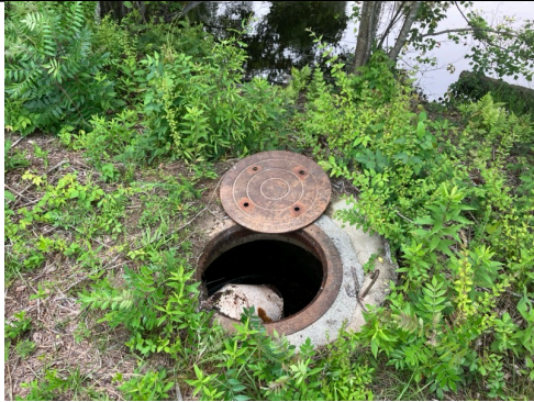
Lake 1 Ocs

Fountain/Aerator Condition: N/A= Not Applicable