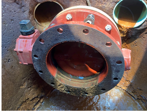
Lake 3 Valve closed