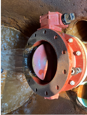
Lake 3 Valve open

Fountain/Aerator Condition: N/A= Not Applicable