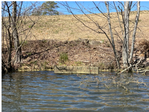
Inlet 3 (lake 1 outlet)