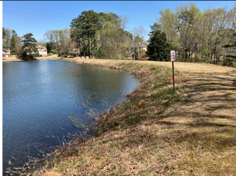
Front of dam