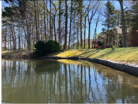
Erosion near riser

Fountain/Aerator Condition: N/A= Not Applicable