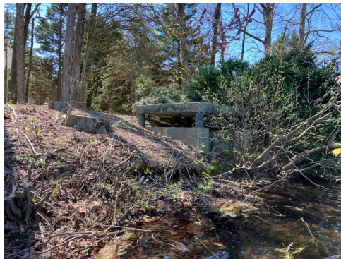
Riser with erosion