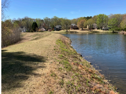
Front of dam