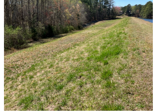
Back of dam