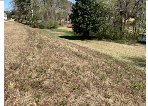
Back of dam