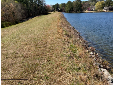
Front of dam