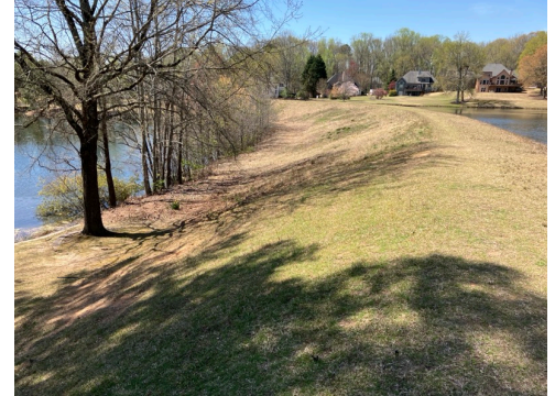
Back of dam