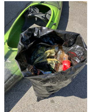
Total trash collected