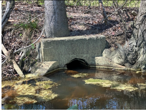
Inlet 3 (lake 2 outlet)

Fountain/Aerator Condition: N/A= Not Applicable