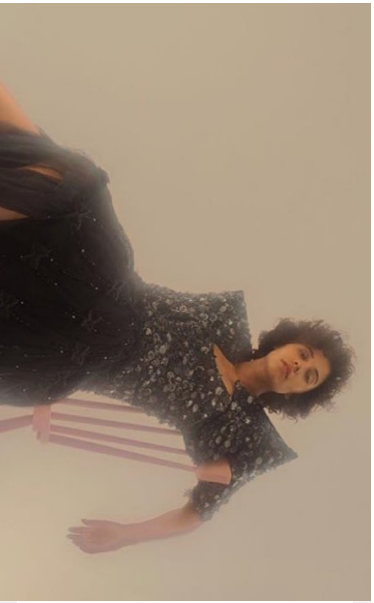
NAOMI SCOTT