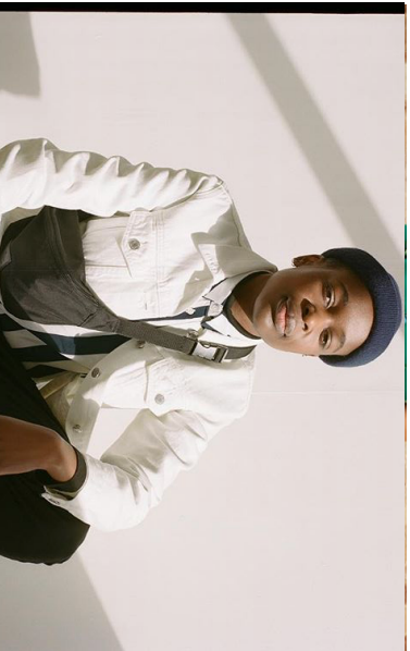
i-D MAG WITH GAP