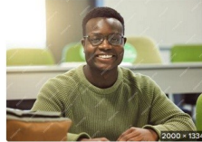
Premium Photo | Black man student and portrait in ...