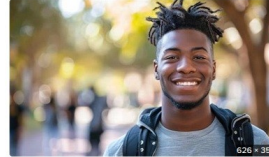
Premium Photo | Glad black male student at the university wit... freepik.com