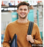
126,600+ White Male College St... istockphoto.com