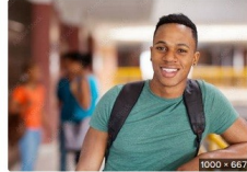
male african american college student Stock Photo... stock.adobe.com