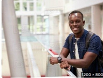
Smiling black male student in modern universit... dissolve.com