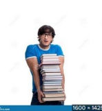
Male Student with Many Books Isolat...