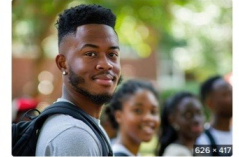
Premium Photo | Black Academics Portrait of Africa... freepik.com