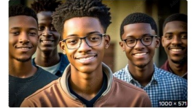
Group of Diverse and Empowered African American Black Yo...