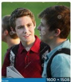
Two Teen Boys Talking Stock ... dreamstime.com