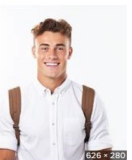
Male college student o...