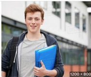
Portrait Of Male Student Standing Outside ...

All regions Safe search: moderate NEW AI images: show Any time All sizes All colors All types All layouts All Licenses