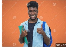
Successful Black Male Student with Beard Showin...