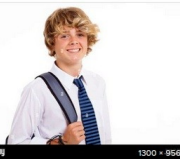
Young Teen High School fity.club