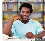
Too Smart To Succeed, Too Good To ... huffingtonpost.com