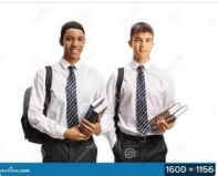
Male Students in School Uniforms Holding B...