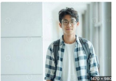
White Male Student Stock Photos, Images and Bac... vecteezy.com