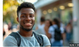
Premium Photo | Glad black male student at the university wit... freepik.com