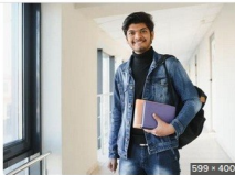
White Male Student Stock Photos, Images and B...