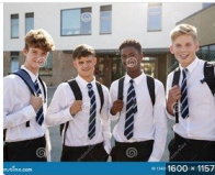
Portrait of Smiling Male High School Student...