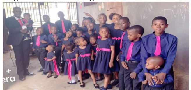
Youth at Church anniversary celebration

Church May was the 9 th anniversary of the Church which started out as a few people meeting in a school room. We now have an official church and it is making a big difference in the neighborhood.