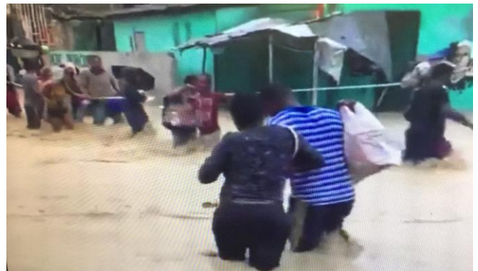
Escorting people across the flooded street

Recently many towns in Haiti were flooded. The videos are showing so much devastation but they are showing the true spirit of the Haitian people. Young men sat up a rope and were escorting people across the flood. They were helping people over a wall to get back into their homes and they were rescuing people caught in the flood and being swept away. These are the Haitians that I know and love.