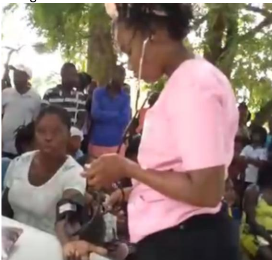
Holding clinic under the trees