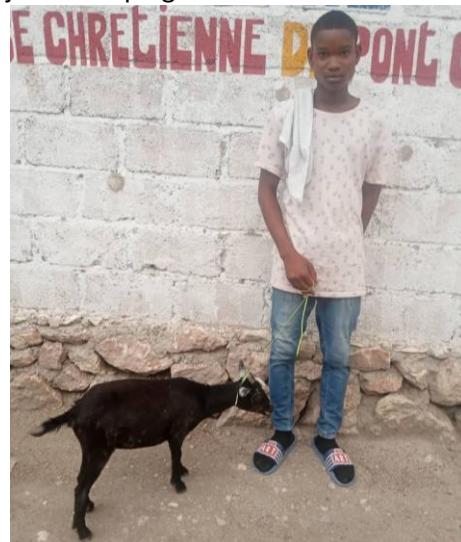
Another family receiving a goat!

My friends have asked me not to visit Haiti for my safety and also for theirs. If the gangs see that they have American friends then they believe that Haitian has access to large amounts of money so it leaves them vulnerable to being kidnapped. We certainly don't want to put any of our friends in danger so for right now we are not visiting Haiti but our friends are doing a great job of keeping us informed and sending pictures.