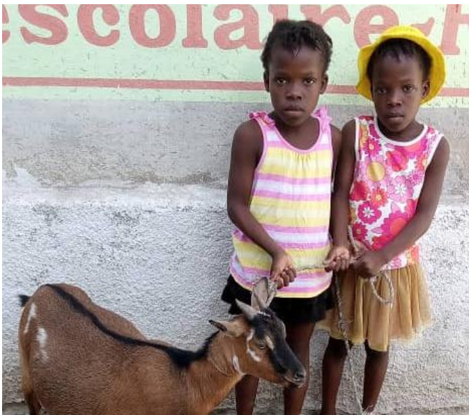
Twins taking care of their goat that just had 2 babies

Merry Christmas and Happy New Year This year has seemed to race by with some things remaining the same and others changing a lot. In Haiti, Christmas and New Years are spent at Church. There will be praying, singing, games, food, special programs and lots of laughter. Both days are joyous occasions in the lives of the Haitian School: Some of our older children have moved on but we have gotten quite a few new students. We are having to pay extra to help feed all the extra students. We have a well at the school but it is needing some work to provide enough water and repair some parts that have worn out. If you feel lead to help with either of these needs please let us know.