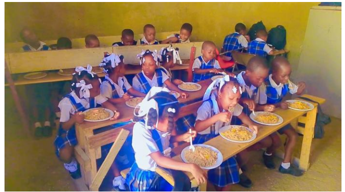
School children in their new uniforms eating lunch.