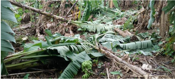
Hurricane damage left in Southern Haiti. Farmers lost most of their crops. These banana trees toppled in the wind

Containers: We believe we have found a way to ship a container through a northern port and then truck the container to Gonaives. Charles has sent me lists of things they really need, food being the main one but they are out of school supplies, and medical items such as wheel chairs etc. Please pray for paths to open up and make this possible and that the gangs do not move into that area. We will need funds for the container also. We are hoping to ship in the spring.