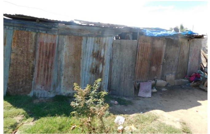
Home of one of our sponsored children

I would like to share a little about one of our sponsored children. This may give you a better idea of why the sponsorship is so important. This little girl is in the second grade. She lost both of her parents to the cholera epidemic. She has two sisters who are living with an aunt. This little girl lives with a grandmother and grandfather who are both sick. There is also an aunt and little baby that live there in this horrible excuse for a home. We gave everyone there medicine (Tylenol, cough syrup etc) as they were not able to afford these things. Their home is only a few pieces of tin barely held together and leaning against a concrete block wall. It had been raining a lot when we were there and as you can see the holes in the roof don't keep out much water. The dirt floor was a muddy mess. And they had no food. (Yes, we left some) Your donations of rice and peanut butter, and medicine help families like this. The sponsorship lets the little girl go to school. Thank you for helping families like this.