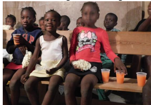
The Jesus movie, juice, popcorn and your best friend, could it get any better?

We were able to show the Jesus movie 3 times while we were there. We provided popcorn and juice as it played. We left a donated TV, DVD player, and the movie so now they can play it as often as they want. The people were very glad to have these. Since about half the Haitians are unable to read this is a great teaching tool.