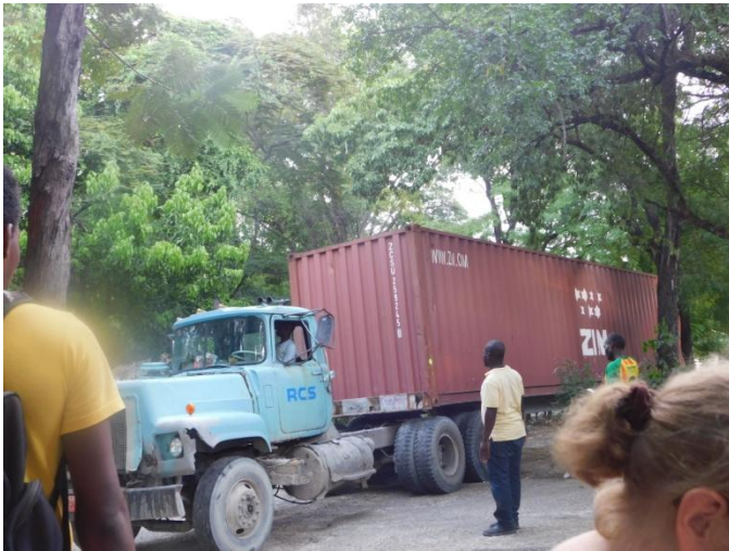
Much excitement as 2 containers pulled into the unloading lot!

Containers: We have shipped 2 containers this year. We invited other mission groups to place things on these containers. The first container had 5 other mission groups, the second one had 12 groups or individuals represented on the container. We were also able to assist another group get 2 containers of food to Haiti and one group to get a much needed boat motor to their mission. We are in the process of helping another group send a container in December. These containers are really blessing the people of Haiti. They are expensive so if you would like to help with this please let us know.