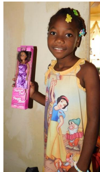
This little girl loves her new doll!

Donations: Another thank you must go out to the mother and daughter who heard the little girls had no toys and went out and purchased so many great dolls!