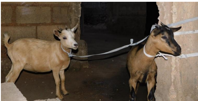
2 goats waiting to go to their new homes!