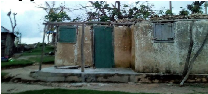
Roof blew off during the hurricane. We sent food and clothes and helped replace a roof.

School: The school is now expanding and adding new classrooms on the second floor. The sponsorship is going well with several new children being sponsored. We were able to visit with all the sponsored children's families and we interviewed many more children and their families who are waiting to be sponsored. The teachers are getting paid on a more regular basis. Food was brought in on 2 different containers so the children are being fed on a more regular basis! If you are interested in sponsoring a child please check out the kids on our website www.dreamsforhaiti.org under sponsored kids. It is only $25 a month and is really changing children's lives!