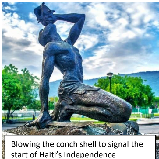
Blowing the conch shell to signal the start of Haiti's Independence