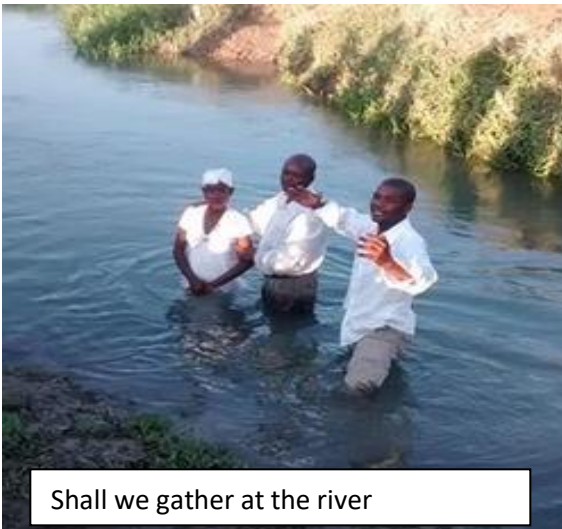
Shall we gather at the river

Most of the homes in the area do not have electricity, running water, or indoor toilets or even indoor kitchens. Church plays a big part in filling a spiritual need and also a social need. It is a gathering place to watch religious films, sing and praise, hold celebrations and just socialize besides the usual activities of weddings and funerals, bible studies and youth groups. Baptisms are held down at the small river that runs close by. Many times Church will start of an evening and go until 4 AM!! Our church buildings are also used for school during the week. After school there are sewing classes for the ladies in the neighborhood. When animal distribution goes on it is in the church. The animals are prayed for. When visiting teams come to do clinic, yes, the Church becomes a clinic! Clothing distribution also takes place at the church. The Church is a very important part of the community.