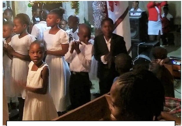
Christmas program. Making a joyful noise!

Trips The 2 containers sent in October should have arrived in late November or early December. One did, the other "missed the boat" as it was full and it had to wait to go on the next one. Finally both containers were there and I (Jackie) was ready to travel to Haiti. And then there were protests which shut down the roads and all government offices including the customs office at the dock. Even though a ticket had been bought it was not going to be possible for me to travel that close to Christmas (airfare went from $800 to $3,000 for that time period) so many emails, texts and phone calls later our wonderful Haitian workers received the 2 containers, organized the unloading, made sure everyone got the correct items (there were 10 different organizations or individuals on these containers) and did a fantastic job of taking care of business without me! This had been our goal all along so we are really excited about it although I really missed being there. We will be shipping another container or two around March and taking a trip to Haiti sometime in April or May. Really hoping to have others join us and see firsthand what all the excitement is about.