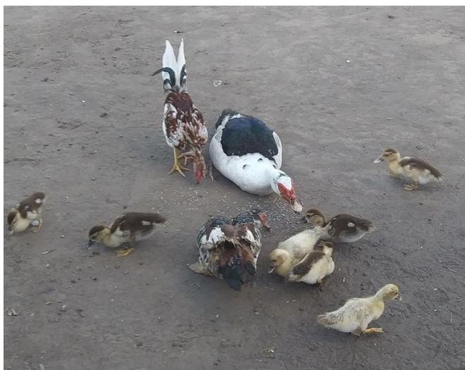
Chicken, Ducks and babies!

It is so exciting to share that Dreams for Haiti and Ambassadors for Christ in Haiti started off the new year with their cupboards full! Just as several other mission organizations did when the 2 containers arrived a few days before Christmas! This is even more exciting as January 1 st is Haiti's Independence day and is celebrated with food and family and friends.