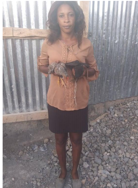
Receiving 2 chickens