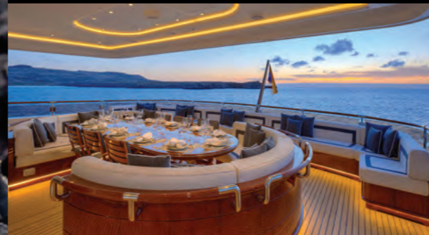
Enjoy Aqua Mare's diverse and dynamic cuisine served al fresco - perfect for appreciating the Archipelago's sweeping vistas