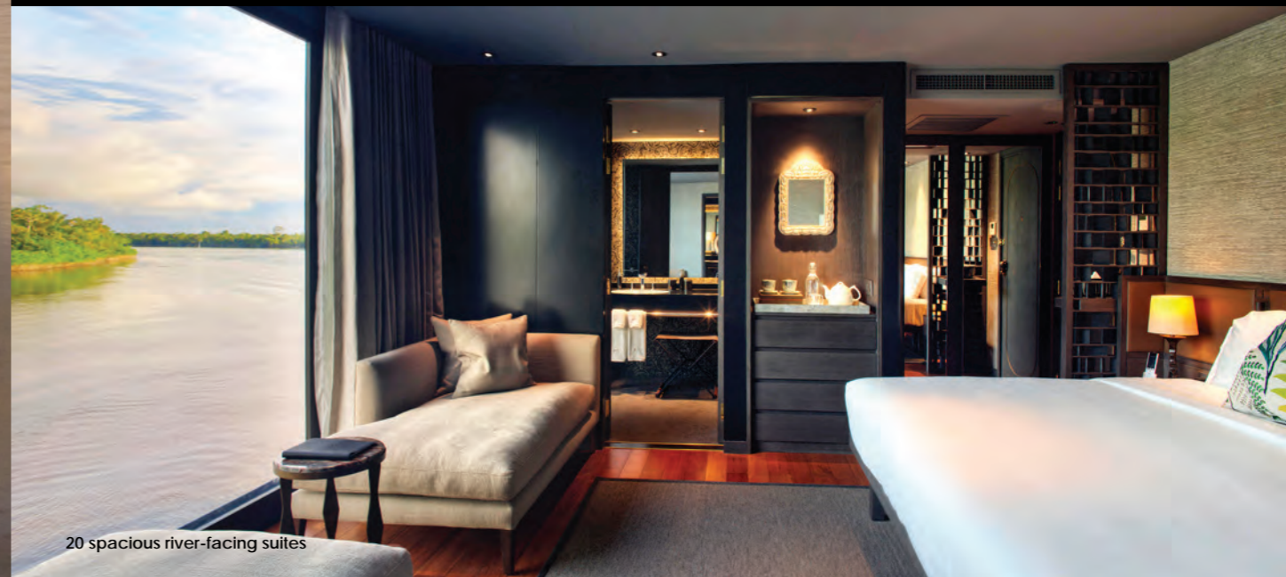
20 spacious river-facing suites