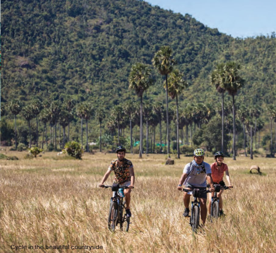
Cycle in the beautiful countryside