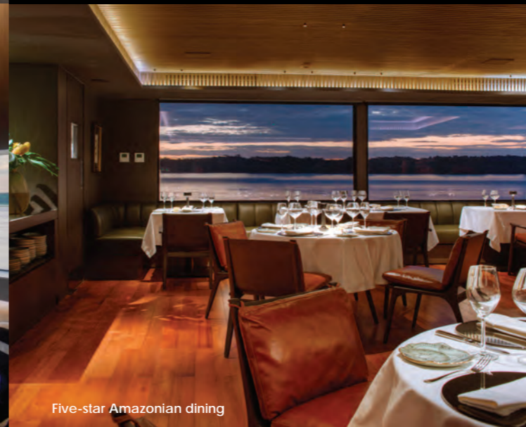
Five-star Amazonian dining