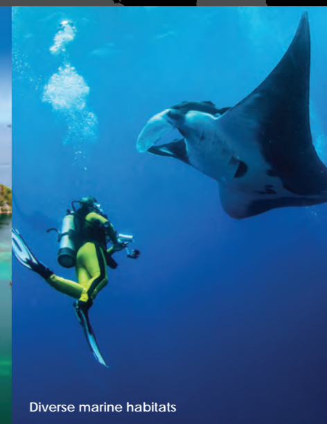
Diverse marine habitats