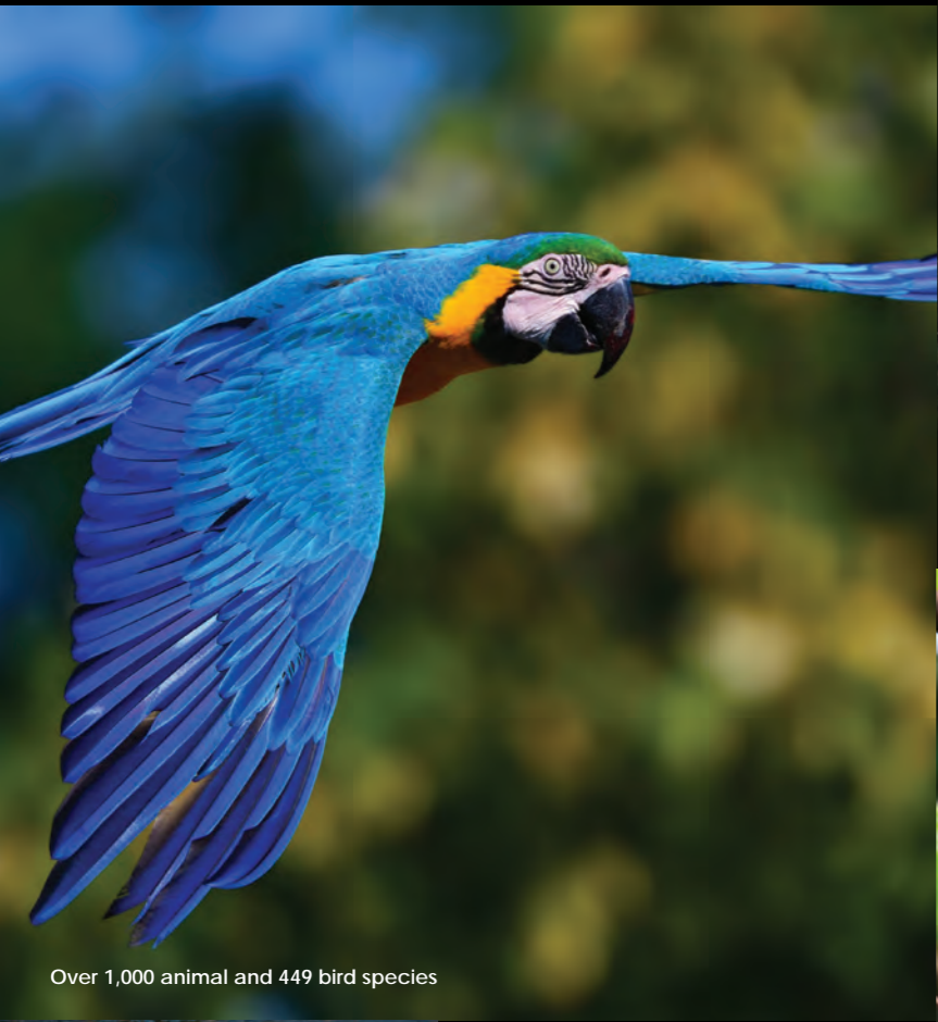
Over 1,000 animal and 449 bird species