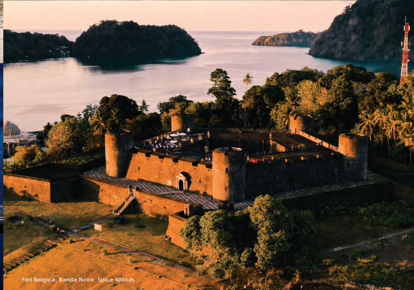
Fort Belgica, Banda Neira, Spice Islands