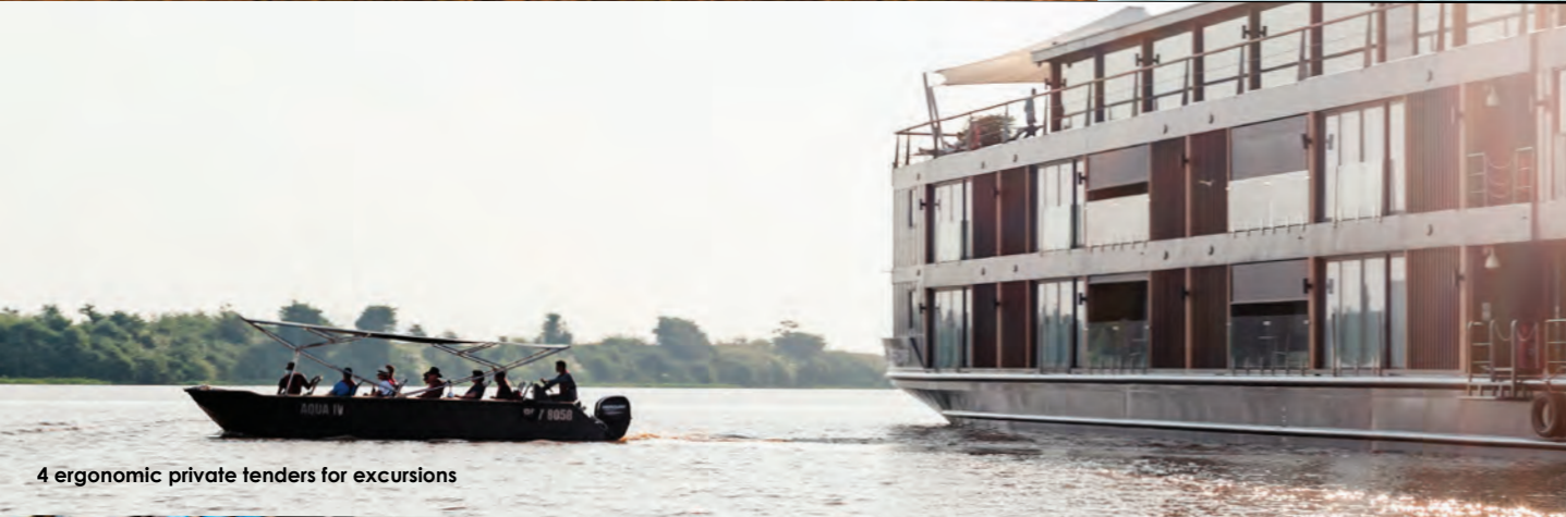
4 ergonomic private tenders for excursions