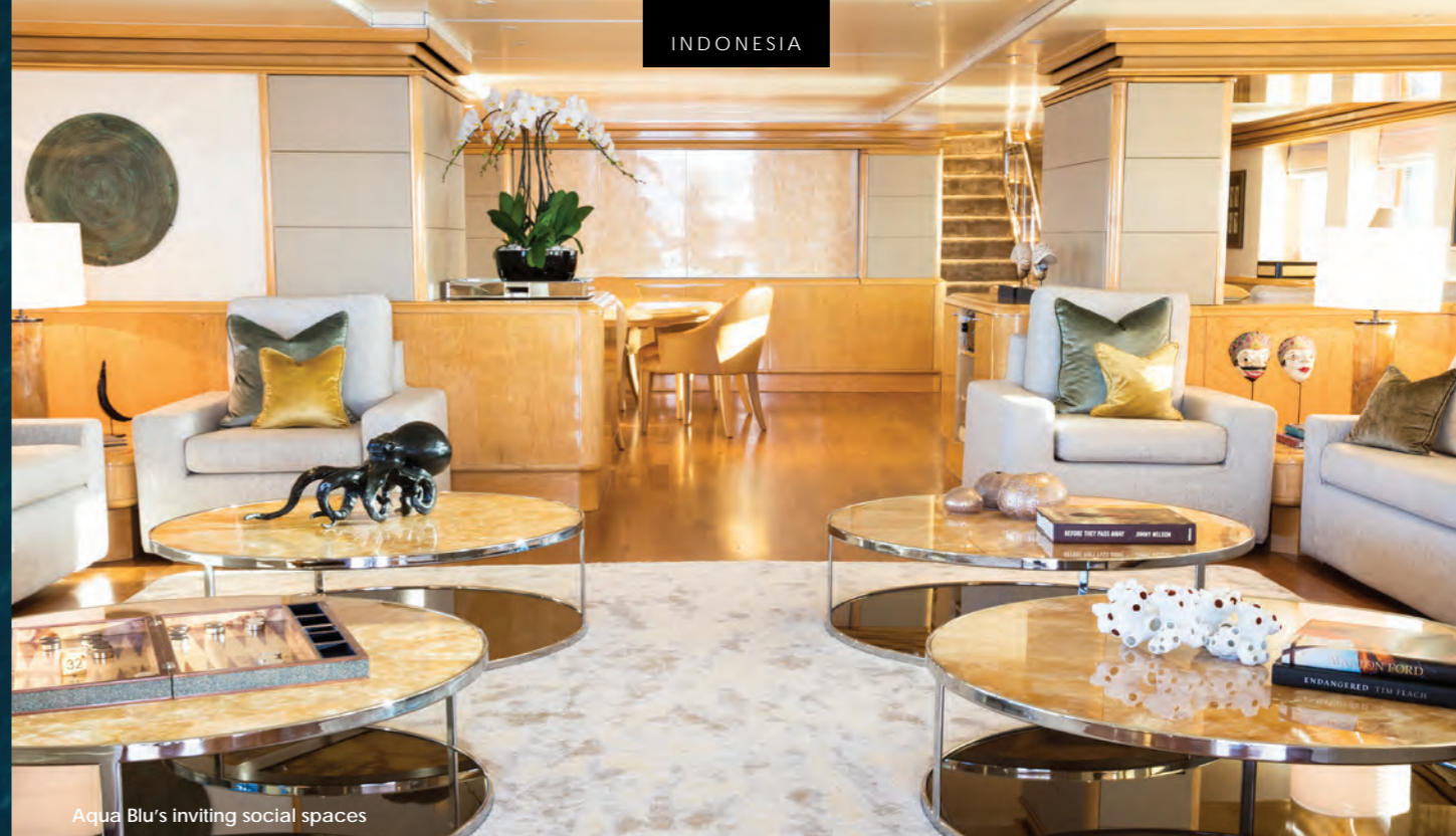
Aqua Blu's inviting social spaces