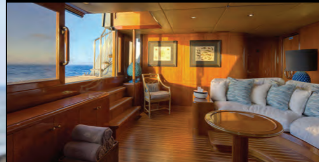
Wind down at our lower deck 'Beach Club' with its panoramic views