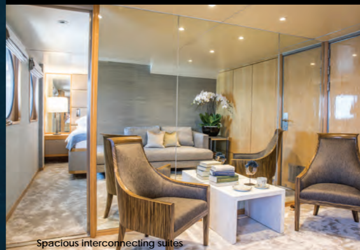
Spacious interconnecting suites