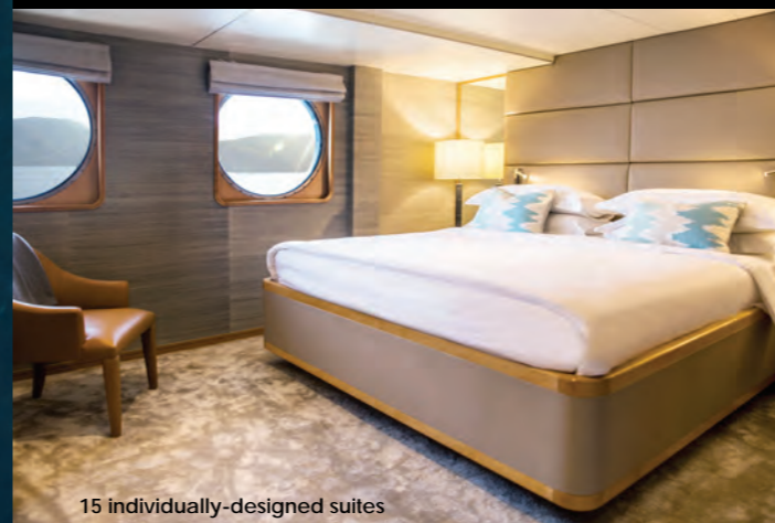
15 individually-designed suites