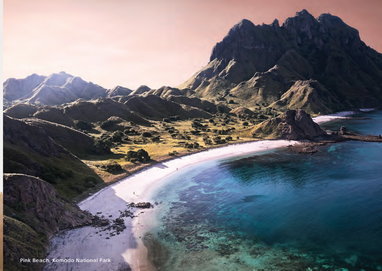
Pink Beach, Komodo National Park