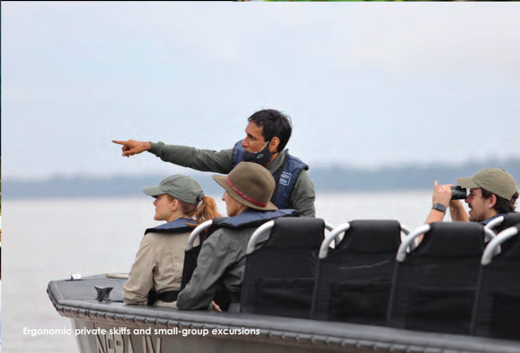
Ergonomic private skiffs and small-group excursions