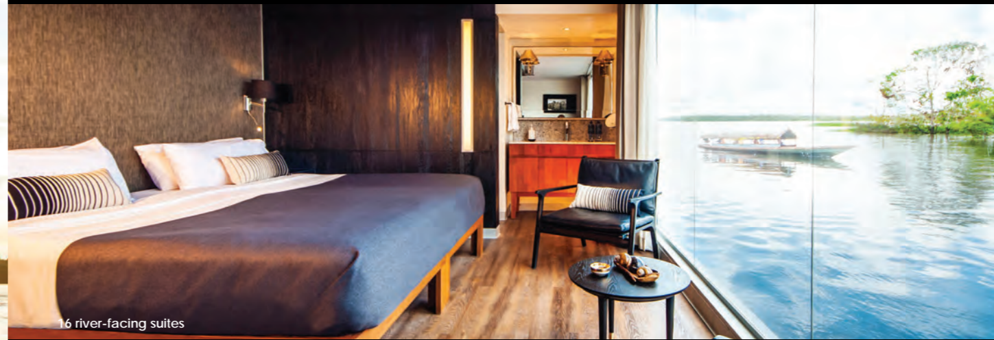
16 river-facing suites