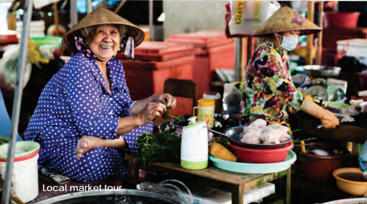
Local market tour