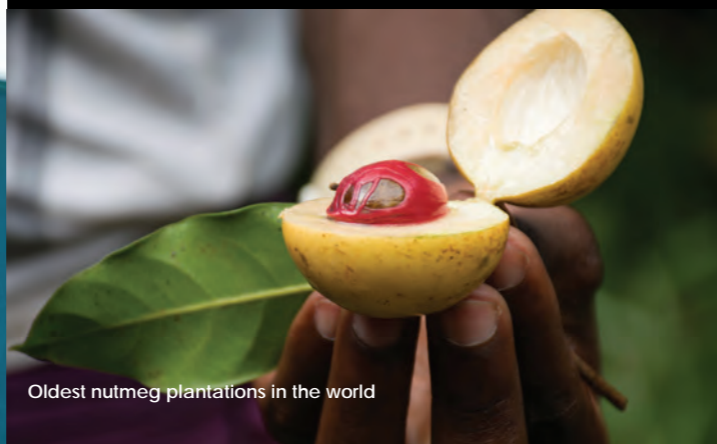
Oldest nutmeg plantations in the world