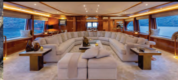
Share stories of your adventure-filled excursions while relaxing at the main lounge