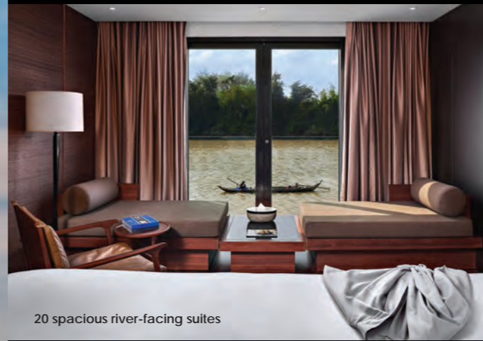
20 spacious river-facing suites