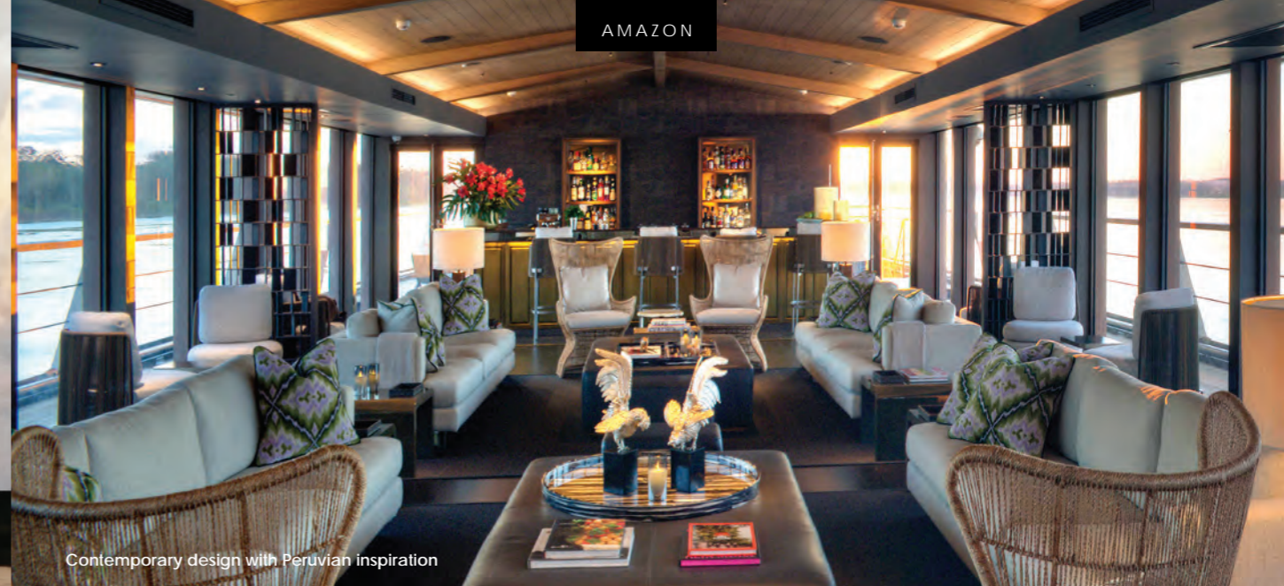
Contemporary design with Peruvian inspiration