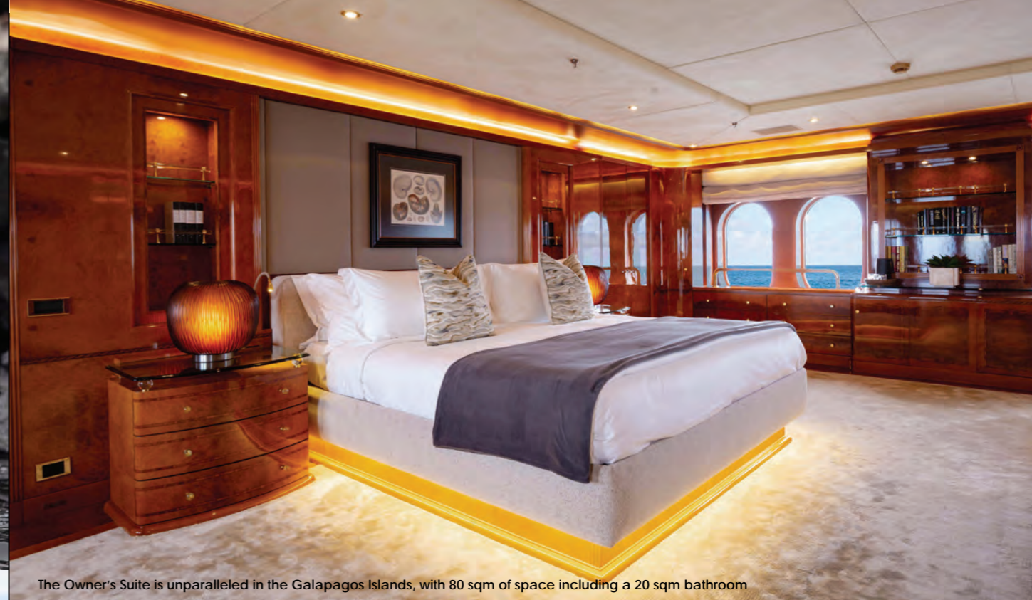
The Owner's Suite is unparalleled in the Galapagos Islands, with 80 sqm of space including a 20 sqm bathroom