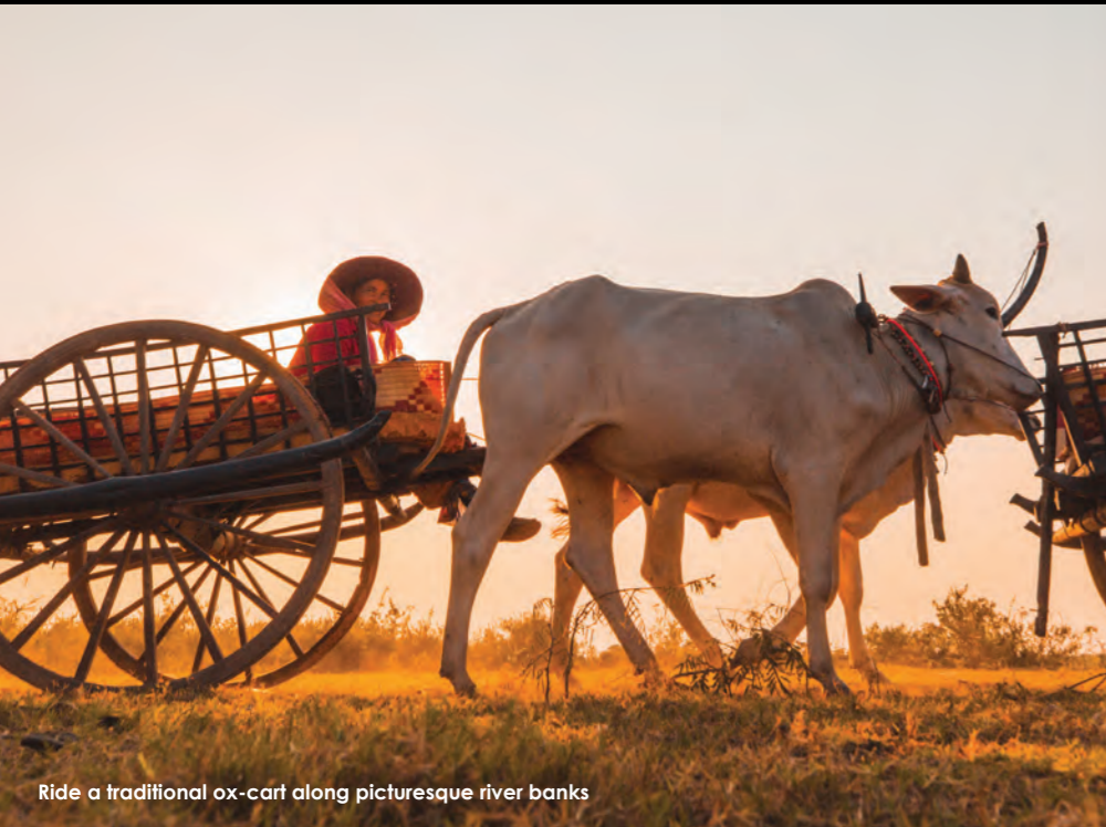
Ride a traditional ox-cart along picturesque river banks