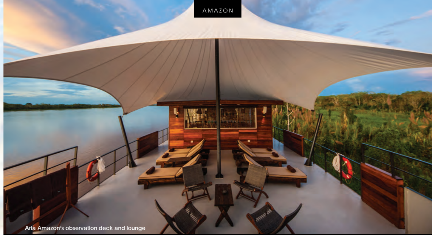
Aria Amazon's observation deck and lounge