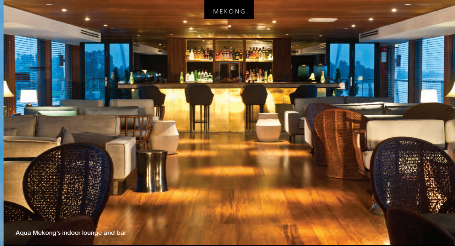
Aqua Mekong's indoor lounge and bar