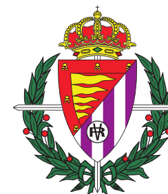
Real Valladolid CF