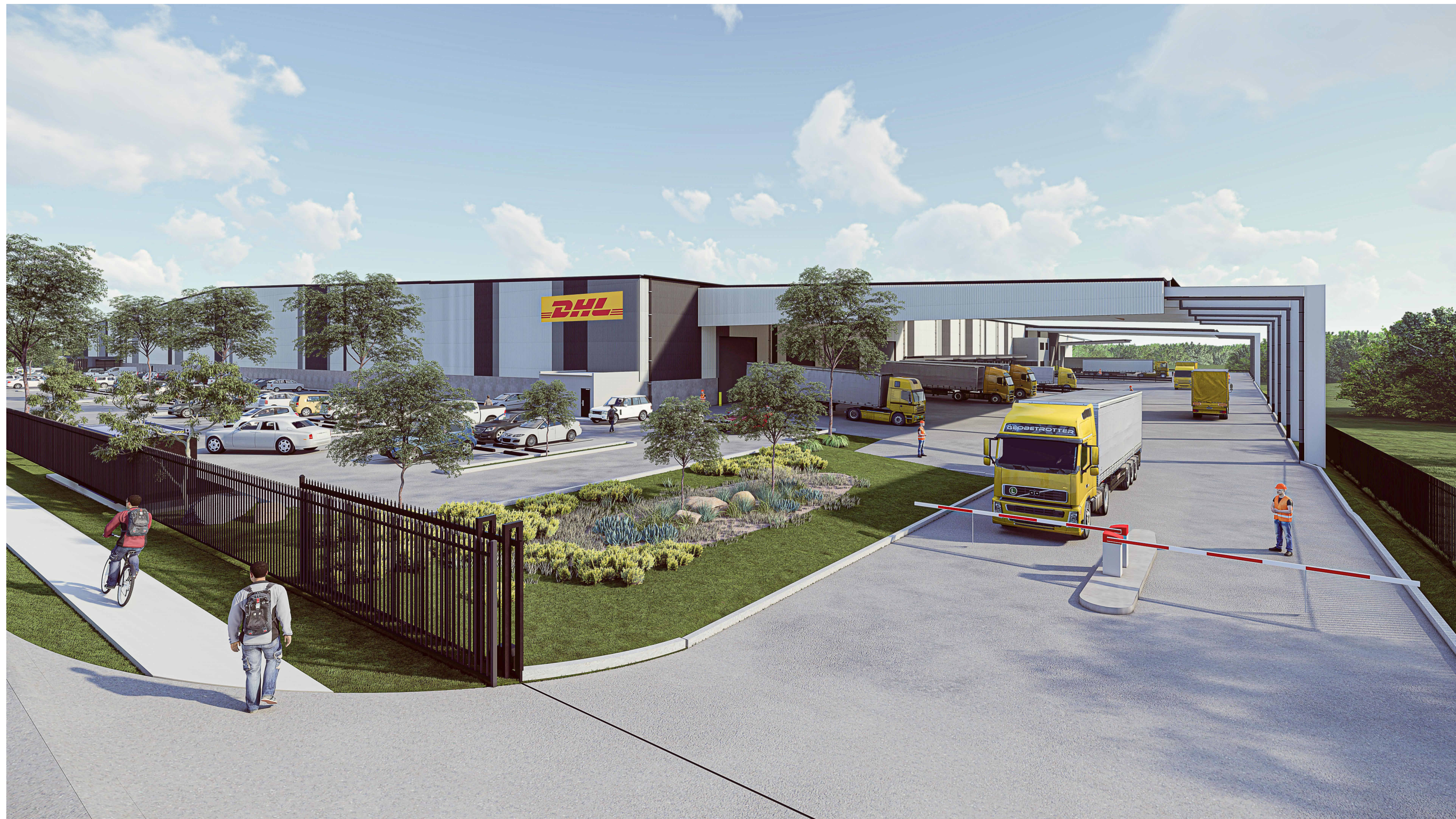
2 PERSPECTIVE 02