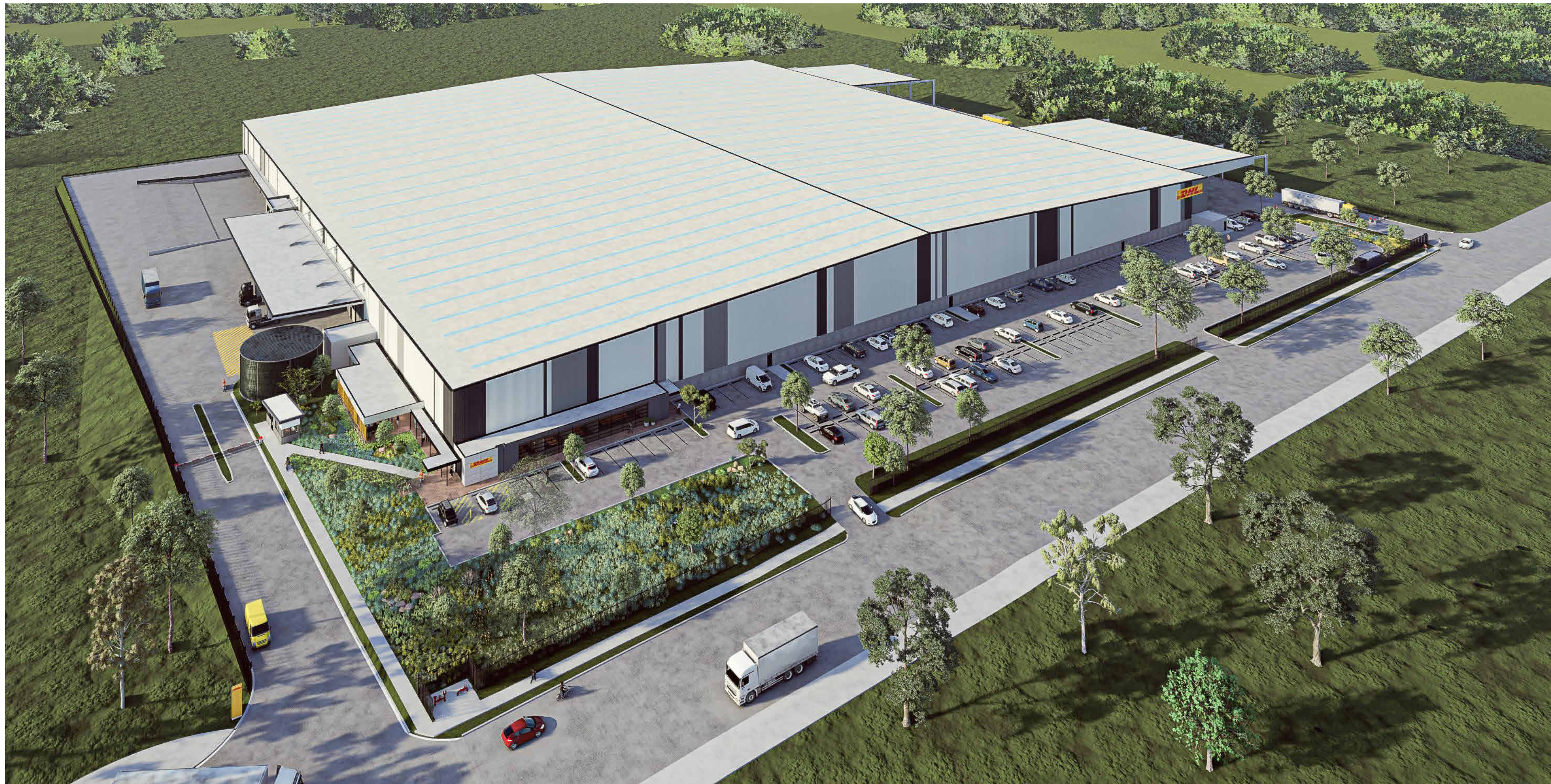
1 PERSPECTIVE 01