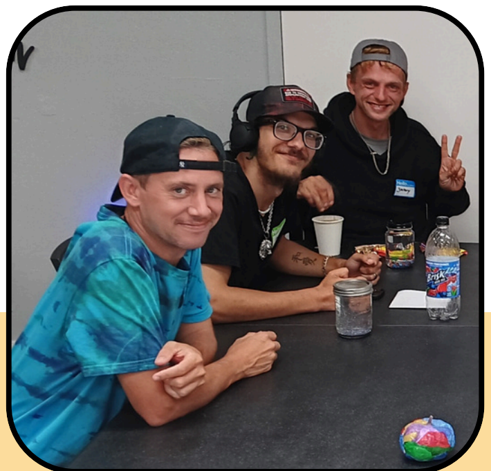
Pictured: Recovery Circle

ReNew Recovery Café continues to be a powerful support and catalyst for change. An evaluation report, conducted by Florida State University based on Member surveys, showed that 82% of our Members reported the Café helped prevent relapse and 86% reported improved mental health.