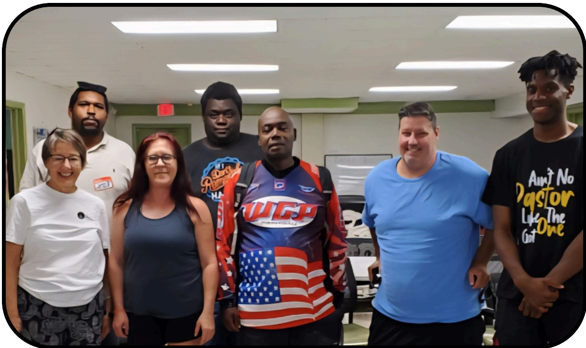
Pictured: First Getting Ahead Class

Getting Ahead allowed participants to explore their strengths, analyze community barriers, increase financial literacy, and strengthen problem-solving and planning skills. Graduates described the program as “life-changing,” “eye-opening,” and “the first time I felt in control of my future.”