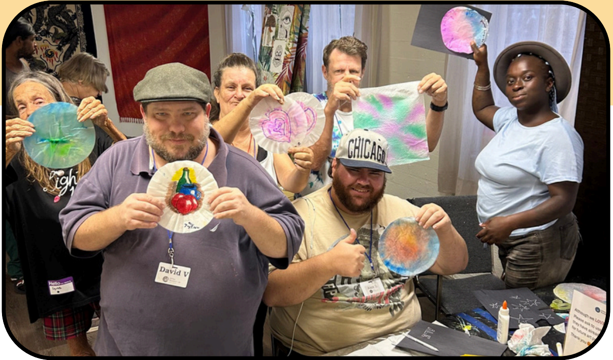
Pictured: Art Class

ReNew Recovery Café continues to be a powerful support and catalyst for change. An evaluation report, conducted by Florida State University based on Member surveys, showed that 82% of our Members reported the Café helped prevent relapse and 86% reported improved mental health.