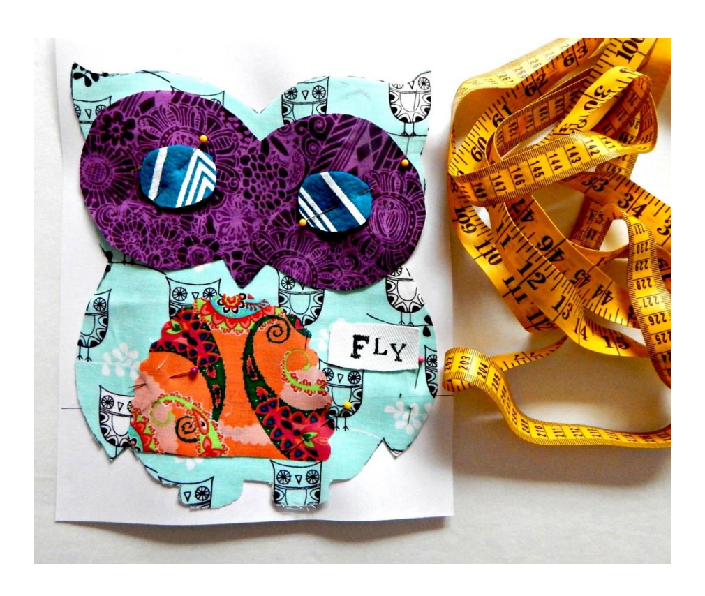
Josey's Art School Happy Owl Sewing Kit

Hi there friend! We are so pleased that you have chosen to begin your sewing adventures with Josey's Art School. Our aim is to offer colorful and whimsical sewing kits that delight your heart and tap into the beautifully tranquil and meditative process that you can experience while sewing. Whether you are sewing this project yourself or sharing this experience with a child, we thank you for choosing Josey's Art School to facilitate the process.