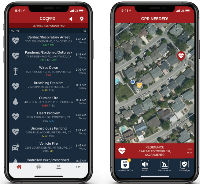
By invitation only. See feature matrix for a complete product comparison.

PulsePoint Verified Responder Pro is the professional version of PulsePoint Respond, providing advanced functionality for agency personnel. Professional verified responders are shown all calls in the jurisdiction along with complete address information and routing for all incident types. These users receive more detailed incident information and additional notification options.