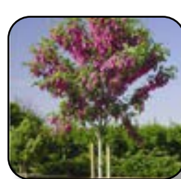
Locust Purple Robe Pg. 18