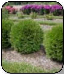
Arborvitae Planet Earth (FE)