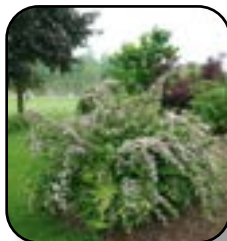
Kolkwitzia-Beautybush Jolene-Jolene (PW)