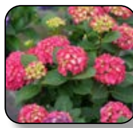
Hydrangea-Big-leaf Wee Bit Giddy (PW)