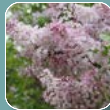
Lilac Dream Cloud Shrub or Tree