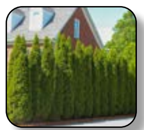
Arborvitae Emerald Green