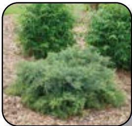
Juniper Montana Moss (PW)