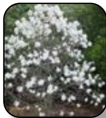
Magnolia Royal Star Pg. 15