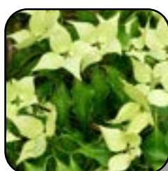
Dogwood Greensleeves Pg. 14