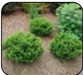
Yew Stonehenge (PW)