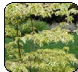
Dogwood Golden Shadows PW Pg. 14