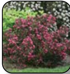
Weigela Wine + Roses (PW)