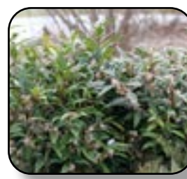
Sweet Box Sweet + Lo (PW)