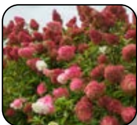
Hydrangea-Panicle Berry White (FE)