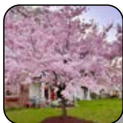
Flowering Cherry Yoshino Pg. 17