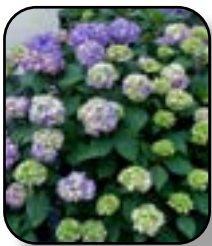
Hydrangea-Big-leaf Bloomstruck (ES)