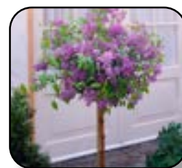
Tree Lilac Bloomerang Dark Purple PW Pg. 18