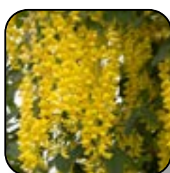
Golden Chain Tree Vossi Pg. 15