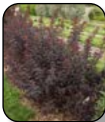
Ninebark Fireside (FE)