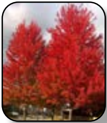
Freemanii Maple Autumn Blaze - Fall Color