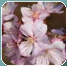
Flowering Cherry Pink Flair

440-661-2258 | 440-685-4306 | 9933 Creaser Road, Orwell, OH 44076