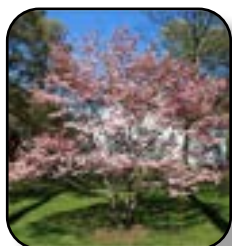
Dogwood Cherokee Brave Pg. 14