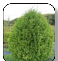
Arborvitae Cheer Drops PW