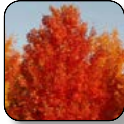
Sugar Maple Fall Fiesta - Fall Color