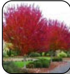
Red Maple Burgandy Belle - Fall Color