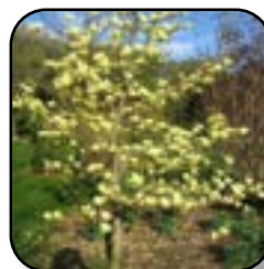
Magnolia Butterflies Pg. 15