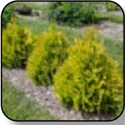
Arborvitae Lemon Burst (FE)