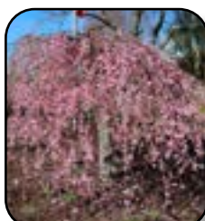
Wpg. Flowering Cherry Pink Cascade Pg. 17