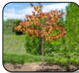
Redbud Flamethrower Pg. 13