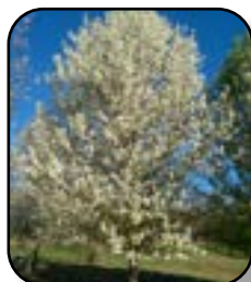
Flowering Pear Chastity Pg. 18