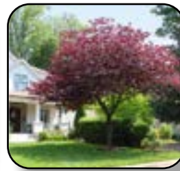
Redbud Forest Pansy Pg. 13