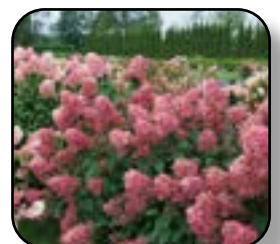
Hydrangea-Panicle Firelight (PW)