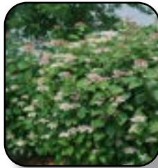
Hydrangea-Smoothleaf Invincibelle Lace (PW)