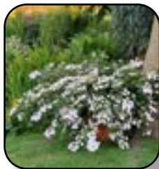
Hydrangea-Cascade Fairytrail Bride