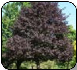
Norway Maple Crimson King