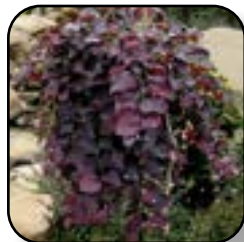
Redbud Ruby Falls Pg. 13