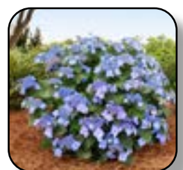
Hydrangea-Big-leaf Pop Star (ES)