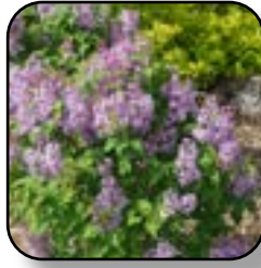
Lilac Scentura Pura (PW)