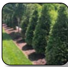
Arborvitae Northern Spire