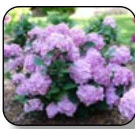
Hydrangea-Big-leaf Let's Dance Skyview (PW)