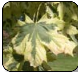
Norway Maple Drummondii