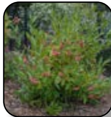
Viburnum Brandywine (PW)