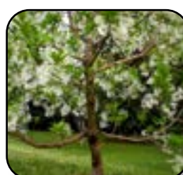
Chionanthus - Fringetree Multi-Stem Virginicus Pg. 13