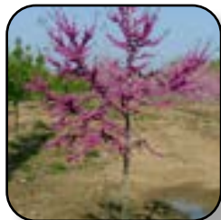
Redbud Luscious Lavender Pg. 13