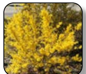
Forsythia Show Off (PW)