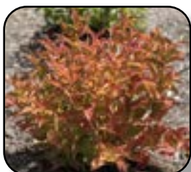
Diervilla - Bush Honeysuckle Kodiak Orange (PW)