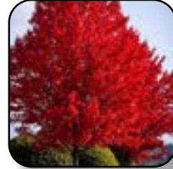
Red Maple October Glory - Fall Color