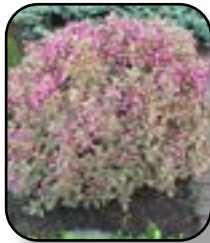
Weigela My Monet (PW)