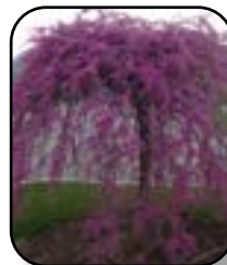
Redbud Lavender Twist Pg. 13