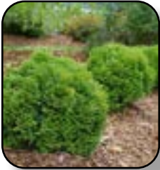
Arborvitae Tator Tot (PW)