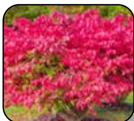
Burning Bush Little Moses