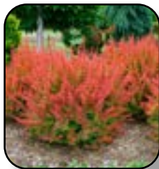
Barberry Tangelo (PW)