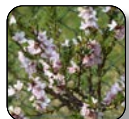
Pink Flowering Almond