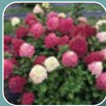
Hydrangea Little Lime Punch Shrub or Tree