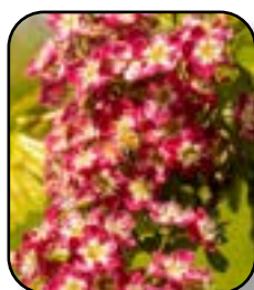
Hawthorn Crimson Cloud Pg. 14