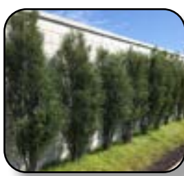
Buckthorn Fine Line (PW)