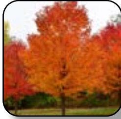
Sugar Maple Commemoration - Fall Color