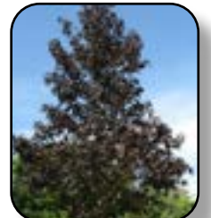
Shantung Maple Crimson Sunset