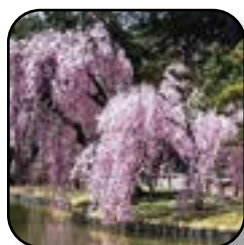
Wpg. Flowering Cherry Higan Double Subhirtella Pg. 17