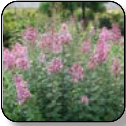
Lilac Bloomerang Ballet (PW)