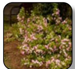
Weigela Rainbow Sensation (FE)