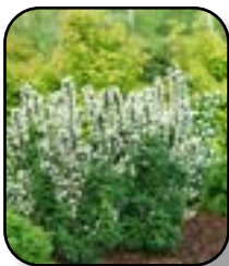
Mock Orange Illuminati Sparks (PW)