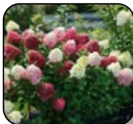
Hydrangea-Panicle Little Lime Punch (PW)