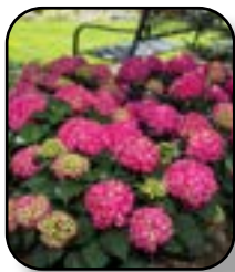
Hydrangea-Big-leaf Summer Crush (ES)