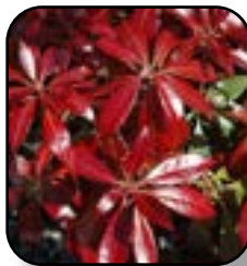
Pieris Japonica Katsura