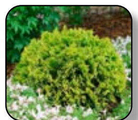
Arborvitae Anna's Magic Ball PW