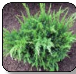
Juniper Sea Green