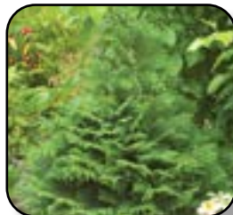
False Cypress Soft Serve (PW)