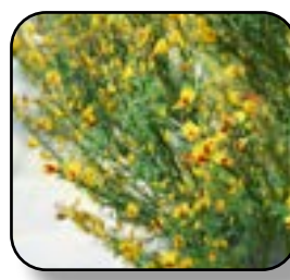
Cytissus - Scotch Broom Sister Disco (PW)