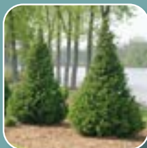
Juniper Gin Fizz PW