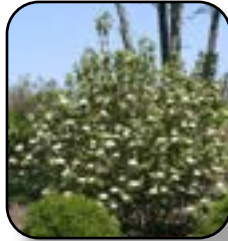
Viburnum Red Balloon (PW)