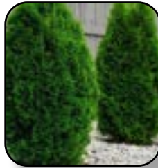
Arborvitae Nigra Dark Green