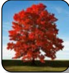
Red Maple Brandywine - Fall Color