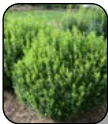
Boxwood Sprinter (PW)