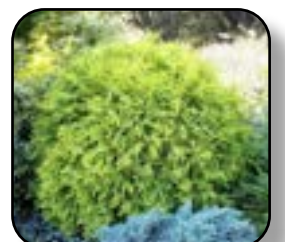
Arborvitae Golden Globe