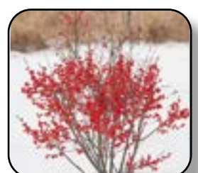
Winterberry Holly Berry Poppins (PW)