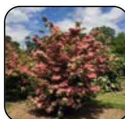
Dogwood Scarlet Fire Pg. 14