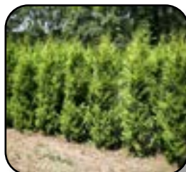
Arborvitae Sugar & Spice