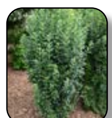
Ligustrum-Privet Straight Talk (FE)