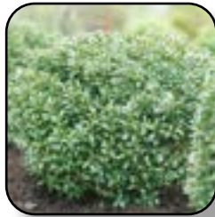
Inkberry Holly Strongbox (PW)