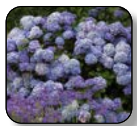
Hydrangea-Big-leaf Endless Summer