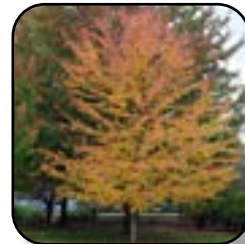
Freemanii Maple Sienna Glen - Fall Color