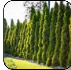
Arborvitae American Pillar