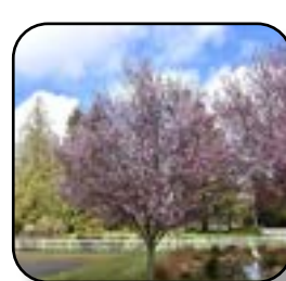
Flowering Plum Mt. St. Helens Pg. 17