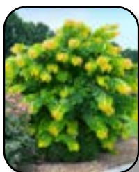
Redbud The Rising Sun Pg. 13