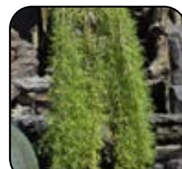
Caragana - Peashrub Walker Pg. 13