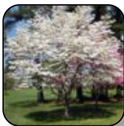
Dogwood Cherokee Princess Pg. 14