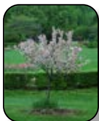
Flowering Crab Coralburst Pg. 16