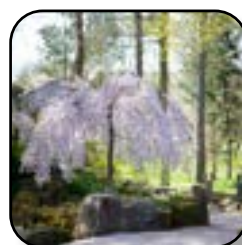
Wpg. Flowering Cherry Snow Fountain Pg. 17