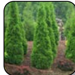
Arborvitae North Pole PW