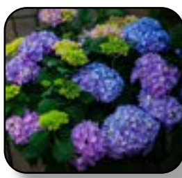
Hydrangea-Big-leaf Let's Dance Rhythmic Blue (PW)