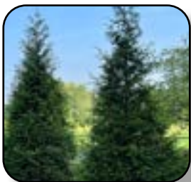
Arborvitae Green Giant