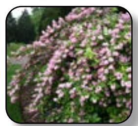
Deutzia Yuki Cherry Blossom (PW)