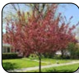
Flowering Crab Showtime PW Pg. 16