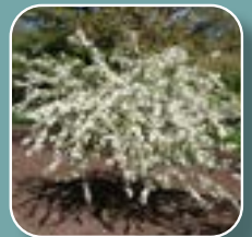
Fl. Crab Weeping Tina