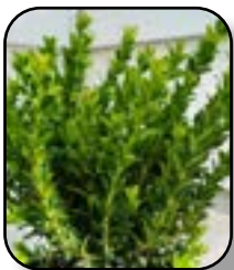
Boxwood Wee Willie