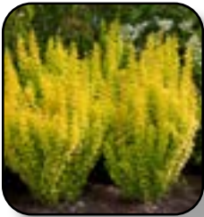
Barberry Gold Pillar (PW)