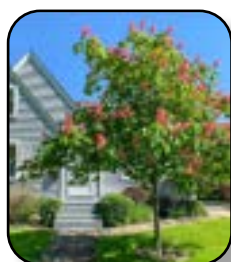
Buckeye Ft. McNair Pg. 12