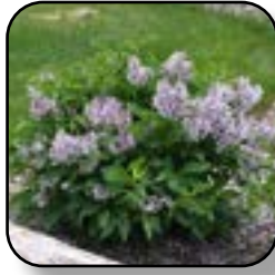
Lilac Little Lady (FE)