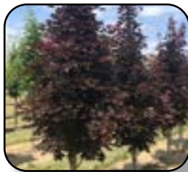
Norway Maple Crimson Sentry