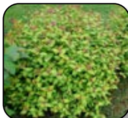
Spirca Double Play Dolly (PW)