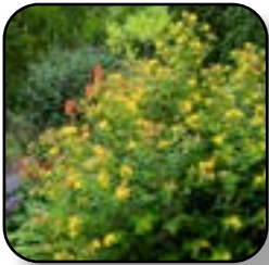
Hypericum-St John's Wort Pumpkin (FE)