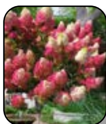
Tree Hydrangea Berry White FE Pg. 14