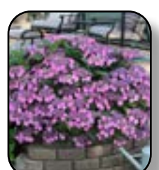
Hydrangea-Mountain Tuff Stuff Top Fun (PW)