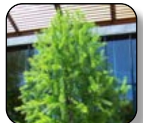
Bald Cypress Shawnee Brave