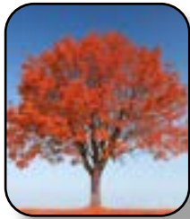
Freemanii Maple Autumn Fantasy - Fall Color