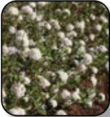
Viburnum Spice Baby (PW)