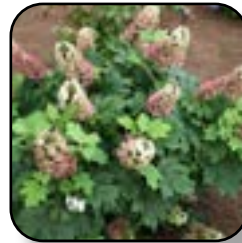
Hydrangea-Oak Leaf Jetstream (FE)