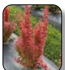
Barberry Orange Pillar