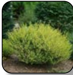
Betula - Birch Cesky Gold (PW)