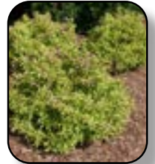
Weigela Bubbly Wine (PW)