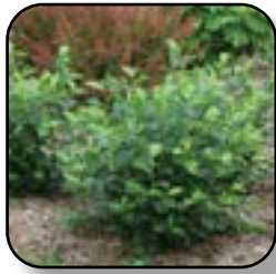
Aronia Low Scape Hedger (PW)