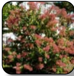
Heptacodium-Seven-son Flower Temple of Bloom (PW)