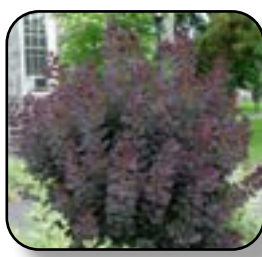
Cotinus - Smokebush Royal Purple