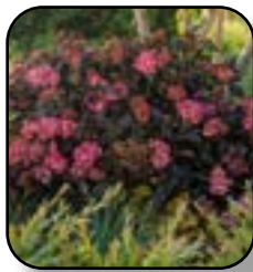
Hydrangea-Big-leaf Eclipse (FE)