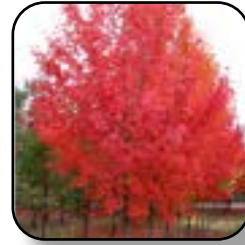
Sugar Maple Highland Park - Fall Color