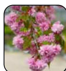
Flowering Cherry Weeping Extraordinaire PW Pg. 17