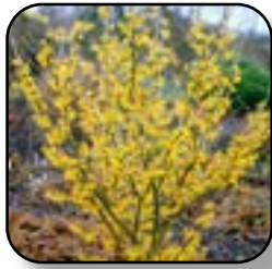
Hammamelis-Witchhazel Arnold Promise