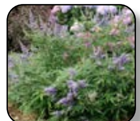
Vitex-Chaste Tree Rock Steady (PW)