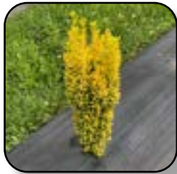
Japanese Holly Glow Stick (PW)