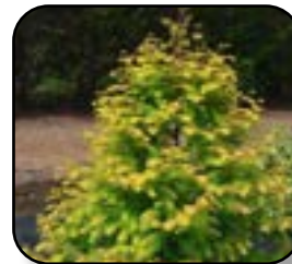
Dawn Redwood Amber Glow