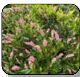
Clethra - Summersweet Ruby Spice