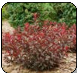
Purple-leaf Sandcherry Stay Classy (PW)