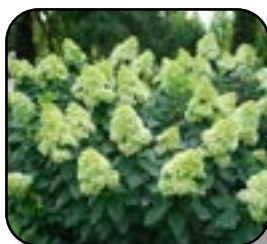
Hydrangea-Panicle Limelight Prime (PW)