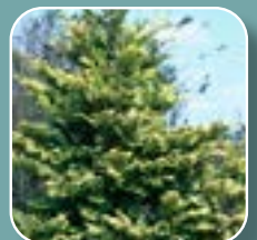
False Cypress Cedar Rapids PW