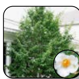
Stewartia Japanese Pg. 18