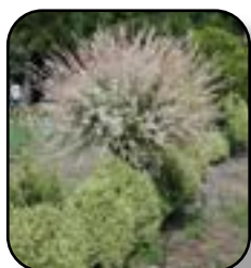
Dappled Willow Tree Form Pg. 18