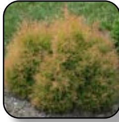
Arborvitae Fire Chief