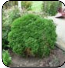
Arborvitae Little Giant