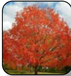
Freemanii Maple Celebration - Fall Color