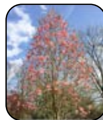
Magnolia Daybreak Pg. 15