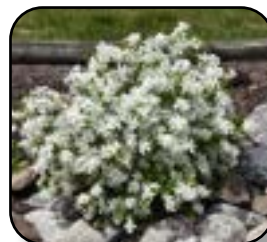
Exechorda - Pearl Bush Lotus Moon (FE)