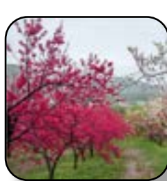
Wpg. Peach Crimson Cascade Pg. 17