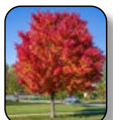
Red Maple Red Sunset - Fall Color