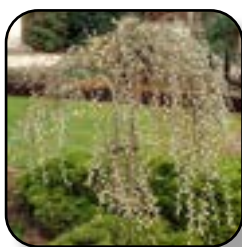
Wpg. Pussy Willow Pg. 18