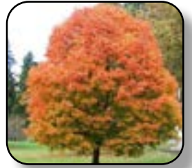
Sugar Maple Legacy - Fall Color