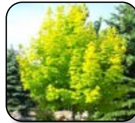
Norway Maple Princeton Gold