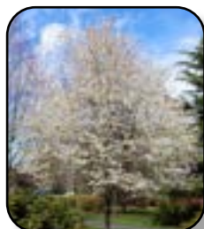
Serviceberry Spring Flurry Tree Form Pg. 13