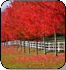
Red Maple Autumn Radiance - Fall Color