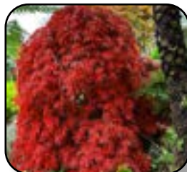
Japanese Maple Orangeola