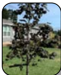
Redbud Midnight Express PW Pg. 13