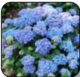
Hydrangea-Big-leaf Let's Dance Loveable (PW)