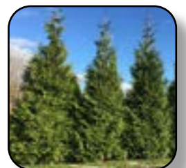
Arborvitae Spring Grove PW