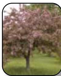
Flowering Crab Indian Magic Pg. 16