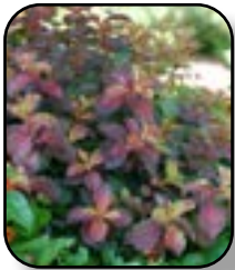
Weigela Midnight Sun (PW)