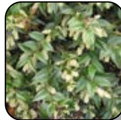
Leucothoe-Doghobble Paisley Pup (PW)