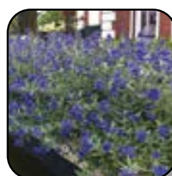
Caryopteris - Bluebeard Sapphire Surf (FE)