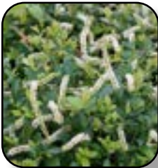
Itea-Sweetspire Fizzy-Mizzy (PW)