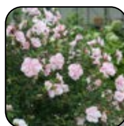
Hibiscus-Rose of Sharon Pink Chiffon