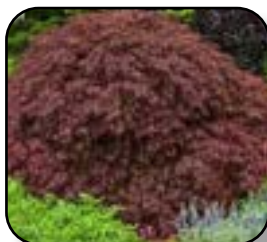
Japanese Maple Crimson Queen