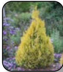
Arborvitae Fluffy PW