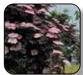
Sambucus-Elderberry Black Lace (PW)