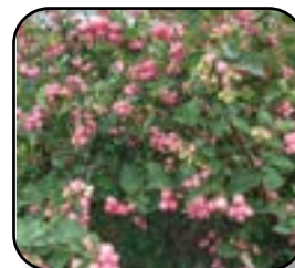
Coralberry Candy (FE)