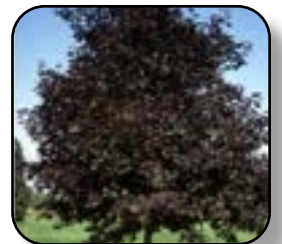
Norway Maple Royal Red