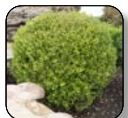
Boxwood Gold Gem