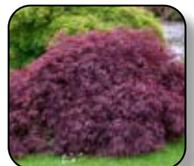
Japanese Maple Tamukeyama