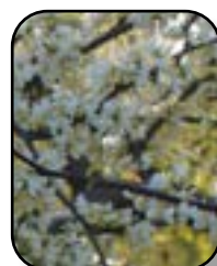
Redbud Vanilla Twist Pg. 13