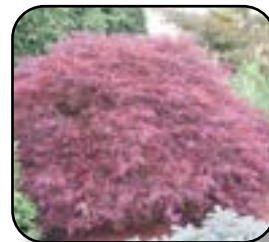
Japanese Maple Red Dragon