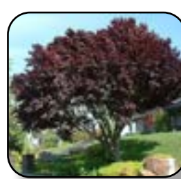
Flowering Plum Thundercloud Pg. 17