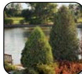
Arborvitae Technito (FE)