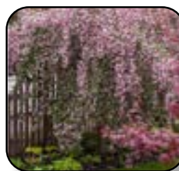
Wpg. Flowering Crab Ruby Tears FE Pg. 16