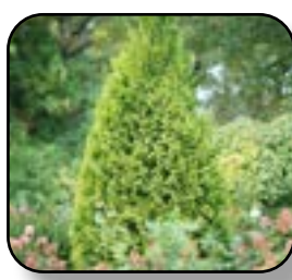
Arborvitae Polar Gold PW