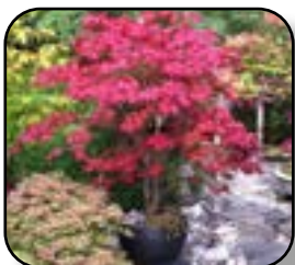
Japanese Maple Bloodgood