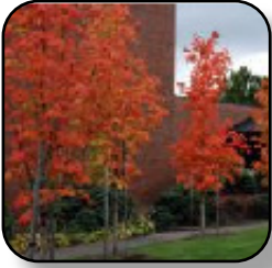
Sugar Maple Apollo - Fall Color