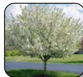
Flowering Crab Sugartyme Pg. 16