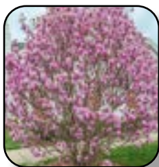
Magnolia Ann, Shrub Form Pg. 15