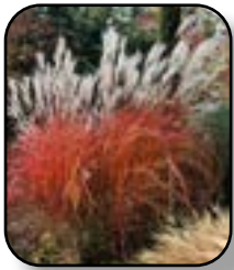
Fire Dragon Fall Color