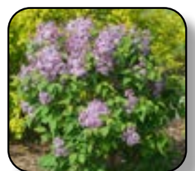
Lilac Baby Kim