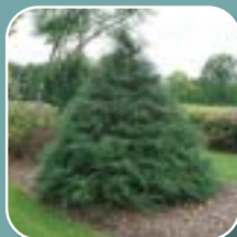
False Cypress Haywire PW