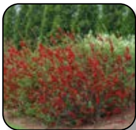
Chaenomeles - Quince Double Take Scarlet (PW)