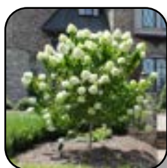
Tree Hydrangea Limelight PW Pg. 15