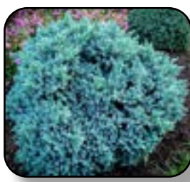
Juniper Blue Star