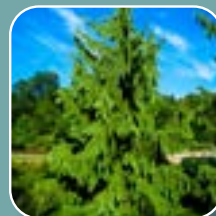
Weeping Alaskan Cedar