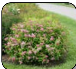
Spirca Double Play Big Bang (PW)