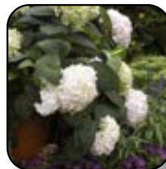
Hydrangea-Big-leaf Blushing Bride (ES)