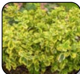
Euonymus - Wintercreeper Gold Splash PW