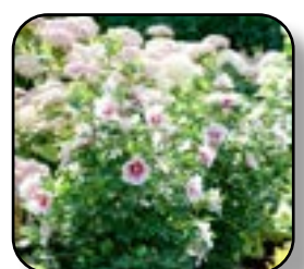
Hibiscus-Rose of Sharon Paraplu-Rouge