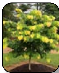
Redbud Hearts of Gold Pg. 13