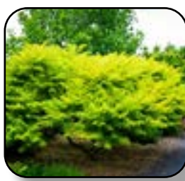
Sumac Tiger Eyes (FE)