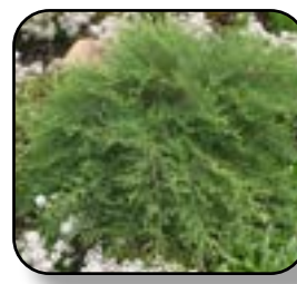
Siberian Cypress Celtic Pride (PW)