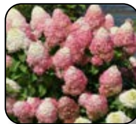
Hydrangea-Panicle Quick Fire Fab (PW)