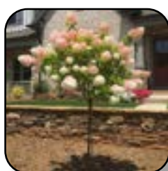
Tree Hydrangea Vanilla Strawberry FE Pg. 15