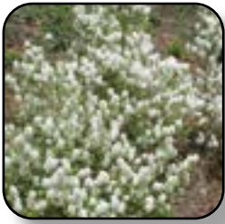
Fothergilla - Bottlebrush Mt. Airy