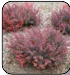
Barberry Mini Maroon (PW)