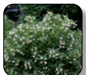
Cephalanthus - Buttonbush Fiber Optics (FE)