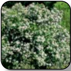
Abelia Sweet Emotion (PW)