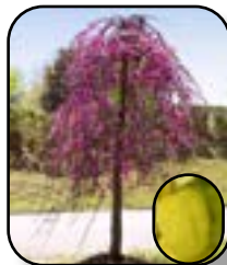
Redbud Golden Falls Pg. 13