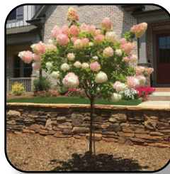
Tree Hydrangea Vanilla Strawberry FE Pg. 13