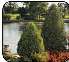
Arborvitae Technito (FE)