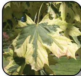
Norway Maple Drummond