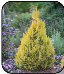
Arborvitae Fluffy PW