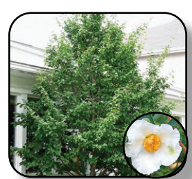
Stewartia Japanese Pg. 16