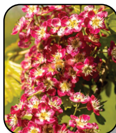
Hawthorn Crimson Cloud Pg. 12