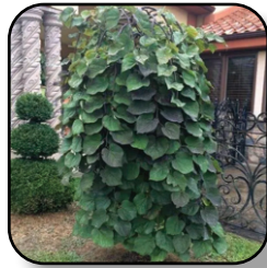
Redbud Ruby Falls Pg. 12