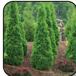
Arborvitae North Pole PW