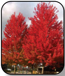
Freemanii Maple Autumn Blaze - Fall Color