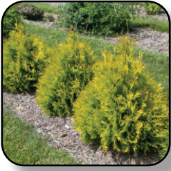
Arborvitae Lemon Burst (FE)