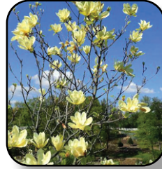
Magnolia Elizabeth Pg. 13