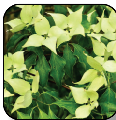
Dogwood Greensleeves Pg. 12