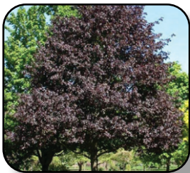
Norway Maple Crimson King