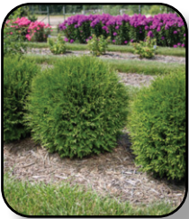
Arborvitae Planet Earth (FE)