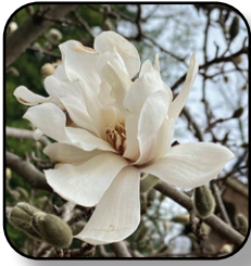
Magnolia Merrill Pg. 13