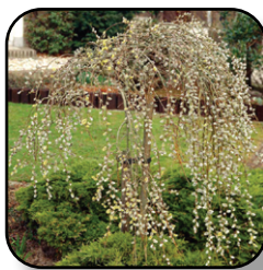
Wpg. Pussy Willow Pg. 15