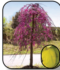
Redbud Golden Falls Pg. 11