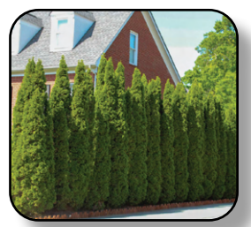
Arborvitae Emerald Green