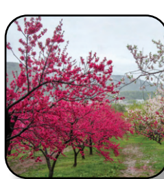
Wpg. Peach Crimson Cascade Not listed