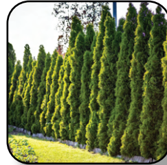
Arborvitae American Pillar