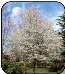
Serviceberry Spring Flurry Tree Form Pg. 11