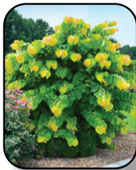
Redbud The Rising Sun Pg. 12