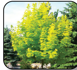
Norway Maple Princeton Gold