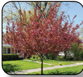
Flowering Crab Showtime PW Pg. 14