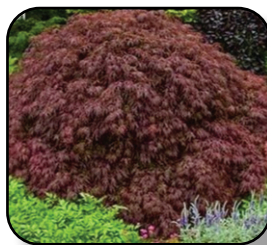
Japanese Maple Crimson Queen