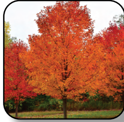
Sugar Maple Commemoration - Fall Color