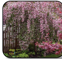
Wpg. Flowering Crab Ruby Tears FE Pg. 14