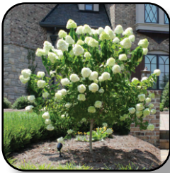
Tree Hydrangea Limelight PW Pg. 13