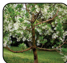
Chionanthus - Fringetree Virginicus Pg. 12