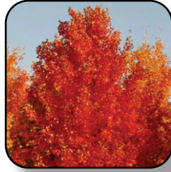
Sugar Maple Fall Fiesta - Fall Color