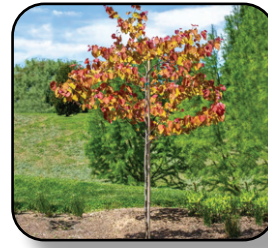
Redbud Flamethrower Pg. 11