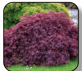
Japanese Maple Tamukeyama