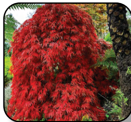
Japanese Maple Orangeola