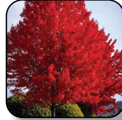
Red Maple October Glory - Fall Color