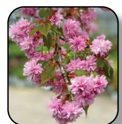
Flowering Cherry Weeping Extraordinaire PW Pg. 15