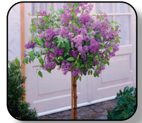
Tree Lilac Bloomerang Dark Purple PW Pg. 16