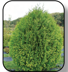
Arborvitae Cheer Drops PW