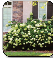
Tree Hydrangea Little Lime PW Pg. 13