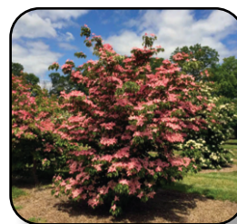
Dogwood Scarlet Fire Pg. 12