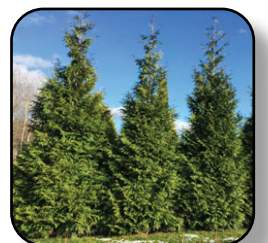
Arborvitae Spring Grove PW