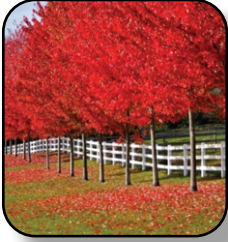
Red Maple Autumn Radiance - Fall Color