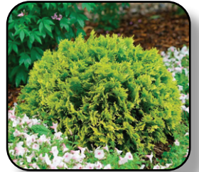
Arborvitae Anna's Magic Ball PW