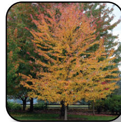
Freemanii Maple Sienna Glen - Fall Color