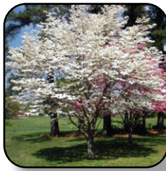
Dogwood Cherokee Princess Pg. 12