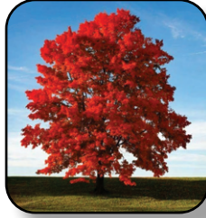
Red Maple Brandywine - Fall Color