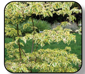
Dogwood Golden Shadows PW Pg. 12