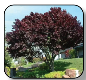
Flowering Plum Thundercloud Pg. 15