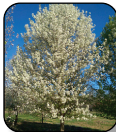
Flowering Pear Chastity Pg. 15