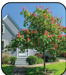
Buckeye Ft. McNair Pg. 11