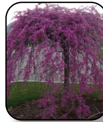
Redbud Lavender Twist Pg. 11