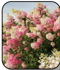
Tree Hydrangea Berry White FE Pg. 13