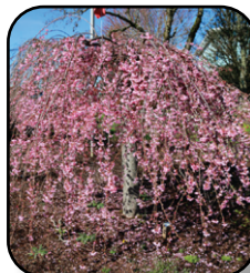
Wpg. Flowering Cherry Pink Cascade Pg. 15