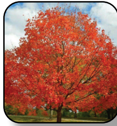
Freemanii Maple Celebration - Fall Color