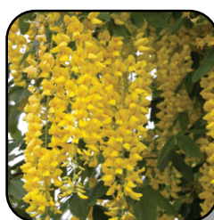
Golden Chain Tree Vossi Pg. 13