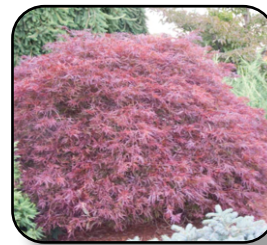
Japanese Maple Red Dragon