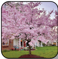
Flowering Cherry Yoshino Pg. 15