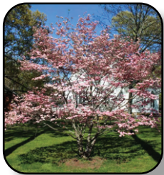
Dogwood Cherokee Brave Pg. 12