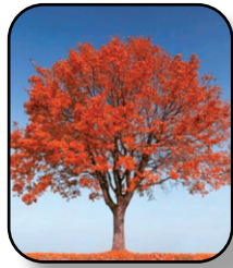
Freemanii Maple Autumn Fantasy - Fall Color