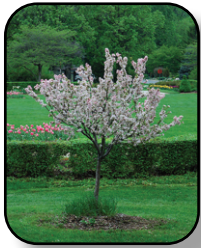
Flowering Crab Coralburst Pg. 14