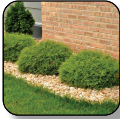
Arborvitae Mr. Bowling Ball (Linesville)