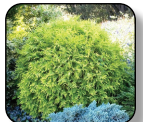
Arborvitae Golden Globe