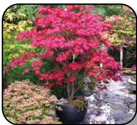
Japanese Maple Bloodgood