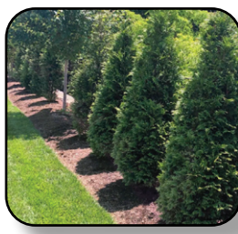
Arborvitae Northern Spire