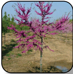
Redbud Luscious Lavender Pg. 11