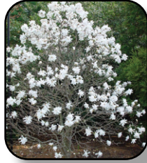
Magnolia Royal Star Pg. 13