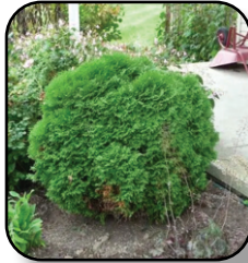
Arborvitae Little Giant