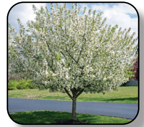
Flowering Crab Sugartyme Pg. 14