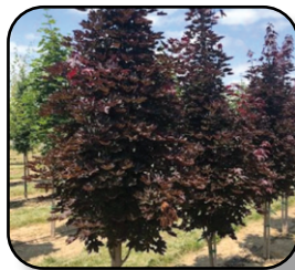
Norway Maple Crimson Sentry