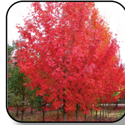
Sugar Maple Highland Park - Fall Color