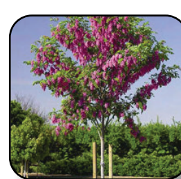
Locust Purple Robe Pg. 15