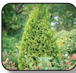
Arborvitae Polar Gold PW