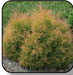
Arborvitae Fire Chief