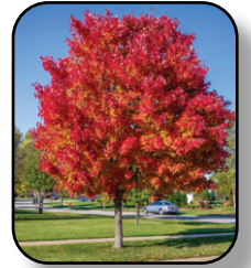
Red Maple Red Sunset - Fall Color