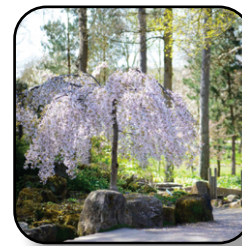
Wpg. Flowering Cherry Snow Fountain Pg. 15