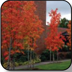
Sugar Maple Apollo - Fall Color