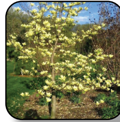
Magnolia Butterflies Pg. 13