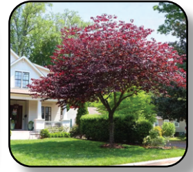
Redbud Forest Pansy Pg. 11