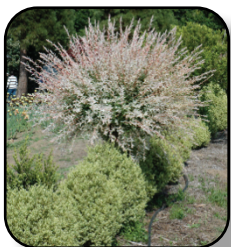
Dappled Willow Tree Form Pg. 15