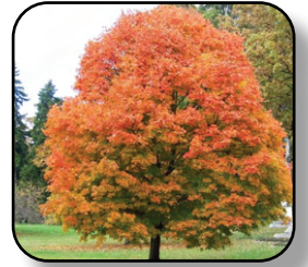
Sugar Maple Legacy - Fall Color