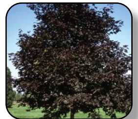
Norway Maple Royal Red