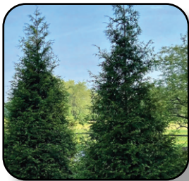
Arborvitae Green Giant