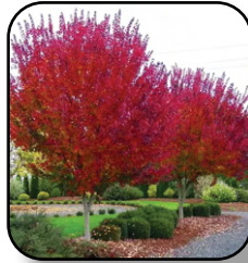
Red Maple Burgandy Belle - Fall Color