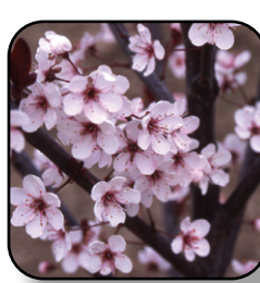
Flowering Plum Big Cis Pg. 15