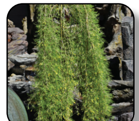
Caragana - Peashrub Walker Pg. 11