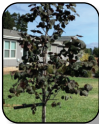
Redbud Midnight Express PW Pg. 11