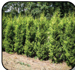
Arborvitae Sugar & Spice