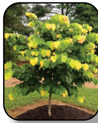
Redbud Hearts of Gold Pg. 11