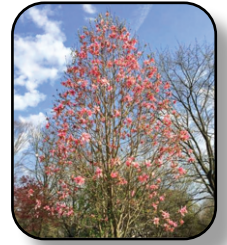
Magnolia Daybreak Pg. 13