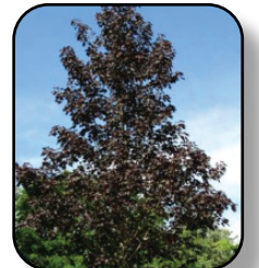
Shantung Maple Crimson Sunset