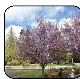
Flowering Plum Mt. St. Helens Pg. 15