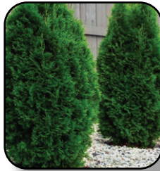
Arborvitae Nigra Dark Green