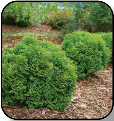
Arborvitae Tator Tot (PW)