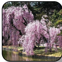
Wpg. Flowering Cherry Higan Double Subhirtella Pg. 15