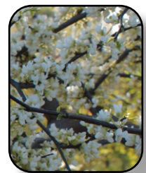
Redbud Vanilla Twist Pg. 12