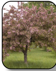
Flowering Crab Indian Magic Pg. 14