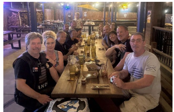
California VI members and our guests