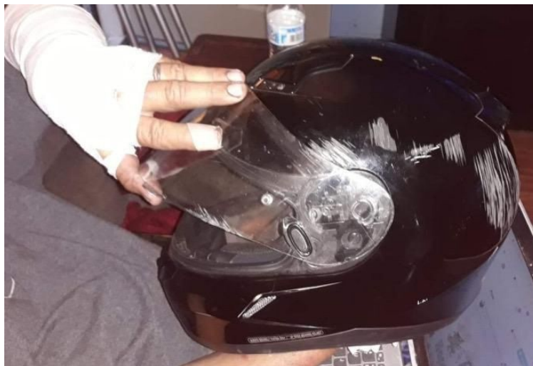
Worst case scenario (NOT MY HELMET)

More than likely your helmet will only have cosmetic damage. Some companies will inspect your helmet if you send it, but they also stress there could be damage that you cannot see. So the big take away here is that you might want to think about buying a new helmet.