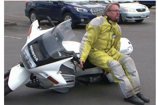
Left side pick up

Picking up a downed motorcycle can be a fun and useful group practice. Or you can do it yourself.