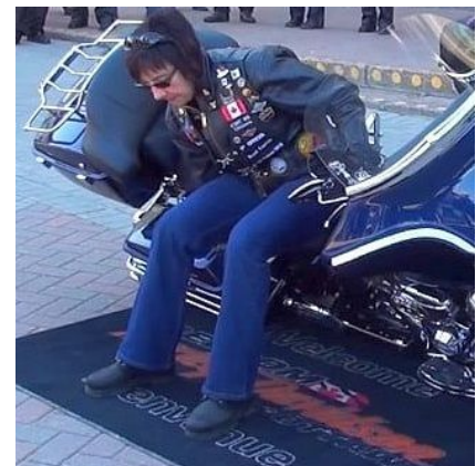
Right side pick up