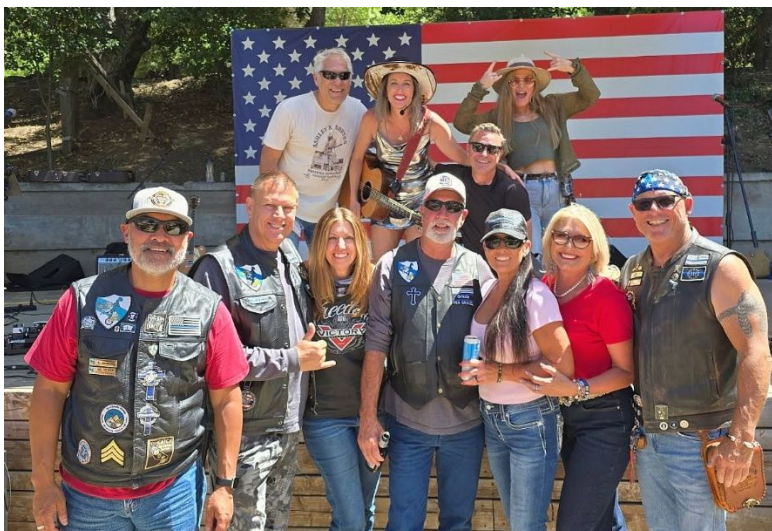
California 6 members and friends

I am already looking forward to next year's Rev & Rally.