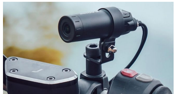
Motorcycle dash cam front mount

In recent years technology has allowed for smaller, more efficient digital cameras that work continuously when mounted as home security cameras or installed in vehicles. Digital Cams have also been specially designed for use on motorcycles. They are compact, with efficient stabilization even with the vibrations inherent with motorcycles. They are weatherproof and include G-sensors to lock crash footage.