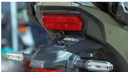
Motorcycle dash cam rear mount

There are several brands available, but all have similar features; and most are "set and forget." While some have batteries, many are hardwired to the ignition, meaning they automatically record everything when you ride. Recordings are on a "loop", recording over old video, usually every hour. Video copies can be saved to cell phones and transferred to other media.