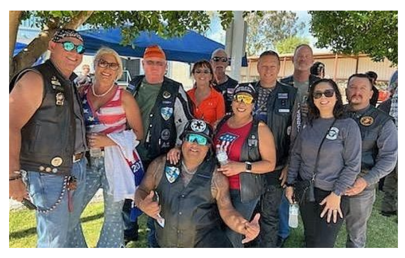
California VI members at El Centro CA X event

Thanks to all who make CAL 6 and all Blue Knights look great and properly represented, and as always, RWP!