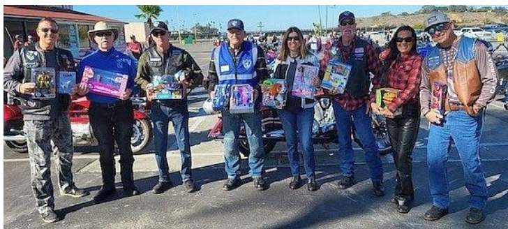
California VI riders arriving at Del Mar

The ride to Del Mar was uneventful. Everyone arrived safely. Motorcycles were directed to park in a designated area. Once everyone parked their motorcycles everyone started placing the toys they had purchased in bins provided by the United States Marine Corps. The riders/passengers were then given a ticket to enter Del Mar Racing Grounds.