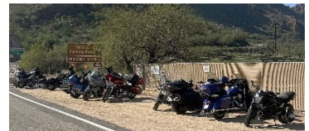
Bikes at Tortilla Flat

Tortilla Flat - an old as dirt Country Store and Saloon (with real horse saddles for bar stools). Its claim to fame: the last surviving stagecoach stop along the Apache Trail.