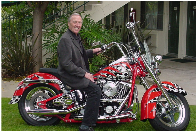
Joseph Wambaugh 1937 – 2025

Joseph Wambaugh will be remembered for bringing his true accounting of police work to the world in 21 books and novels. We are grateful for having known him.