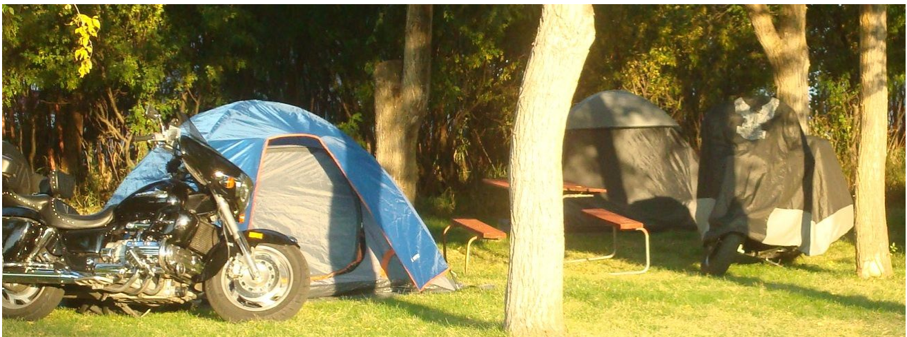
On the road in Utah. Notice the motorcycle on the right...