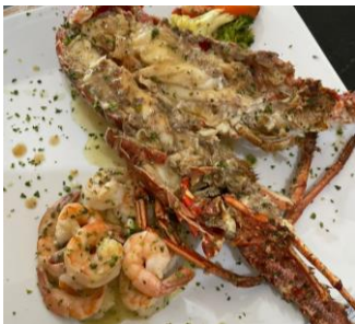
LANGOSTA CON CAMARONES 3,350-5600

Lobster in a garlic sauce with garlic shrimp and sauteed vegetables