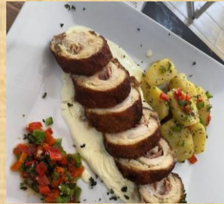
CORDON BLEU 1100 Chicken breast layered with ham and cheese, rolled into a log, chilled, dredged in flour then egg then breadcrumbs then deep fried