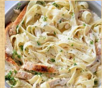
PASTA POLLO A LA PARILLA 900 Your choice of cream, creole, pesto or natural sauce.