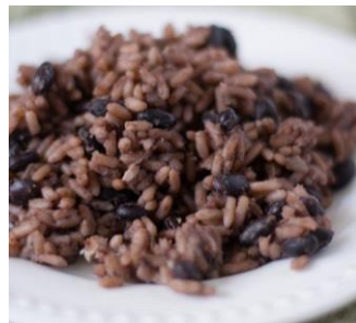
MORO 225 Rice and beans