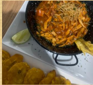
LAMBI A LA CRIOLLA 800 Conch Creole & Fried Plantains