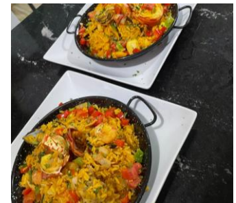
PAELLA CLASSICA 4500

Great for 2ppl. Medly of seafood including mussels, lobster, shrimp, calamari