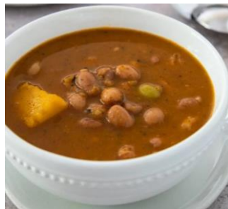
HABICHUELA 200 Classic dominican beans