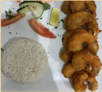
CAMARONES EMPANIZADO 900 Seasoned Breaded Prawns & Steamed Rice