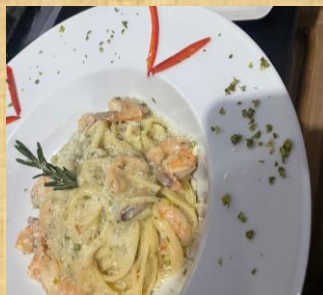
PASTA Y CAMARONES A LA CREMA, PESTO O LA CRIOLLA 1100 Fresh Salmon in your choice of cream sauce, creole, pesto