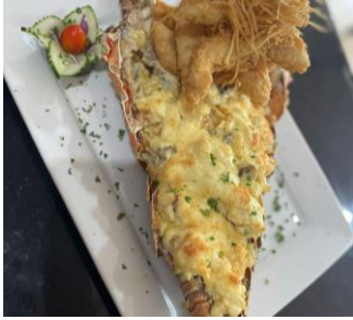
LANGOSTA "THERMIDOR" 2650-5500

Lobster Thermidor buttery wine sauce, sprinkled with cheese, and broiled 1.5 – 4lb