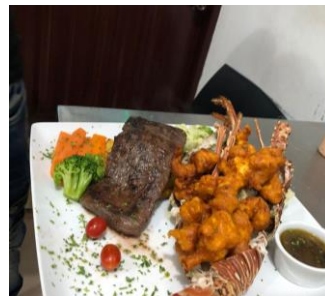
MAR & TIERRA FRITA 4500 - 6000

Lobster in a garlic sauce with garlic shrimp and sauteed vegetables