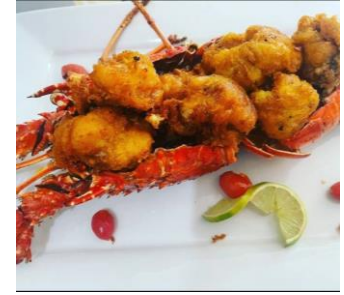
LANGOSTA FRITA 2500 – 5000

Lobster – grilled or steamed in a creole sauce 1.5 lb – 4lb