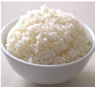
ARROZ BLANCO 200 Steamed rice