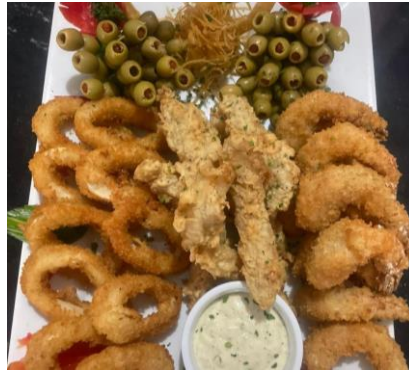
BANDEJA DE MARISCO 2,350

M&A Signature Chicken Wings (BBQ, Buffalo, Lemon Pepper) add fries for 150.