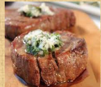
FILET MIGNON 2200 Classic Filet Mignon with your choice of french fries, mashed or sauteed vegetables