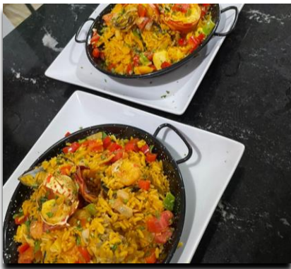
M&A FRUTOS DEL MAR 4000

Taste the essence of Sosua, Dominican Republic, with our Sosua Seafood Paella. This dish captures the coastal charm of the Caribbean, featuring saffron-infused rice adorned with a medley of local treasures—plump shrimp, tender squid, and fresh catch of the day. Each bite is a celebration of the sea's bounty, delivering a vibrant and unforgettable experience reminiscent of Sosua's laid-back coastal atmosphere. Indulge in the flavors of the Caribbean with our Sosua Seafood Paella, a culinary journey in every mouthful.