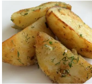
PAPAS SALTEADAS 200 Sauteed potatoes