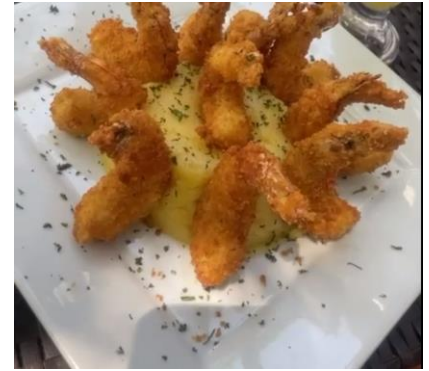
CAMARONES EMPANIZADOS 900

Breaded Seafood Platter includes Shrimp, Calamari and Fish Fingers