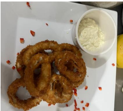
CALAMARES FRITOS 700

Breaded Shrimp with Mashed potatoes and a curry sauce