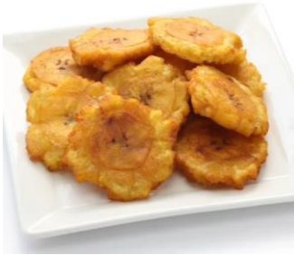
TOSTONES 200 Fried green plantains