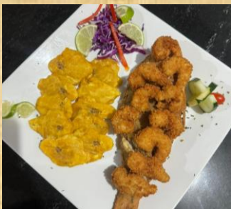
CHILLO Y CAMARON 2600-3800 Fresh Lobster with savory garlic and butter sauce 1.5lb – 3lb