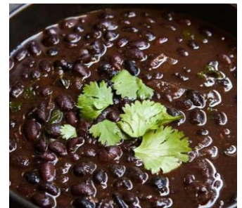
HABICHUELA NEGRA 200 Dominican black beans