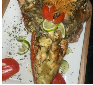
LANGOSTA AL AJILLO 2500-5000

Lobster Thermidor buttery wine sauce, sprinkled with cheese, and broiled 1.5 – 4lb