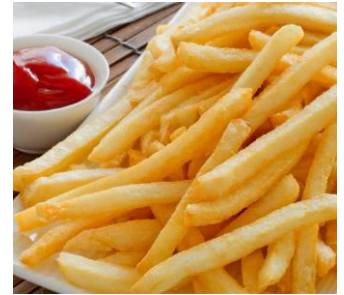
PAPAS FRITAS 200 French fries