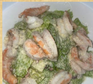
ENSALADA CESAR 1200 Cesar salad with your choice of chicken or prawns