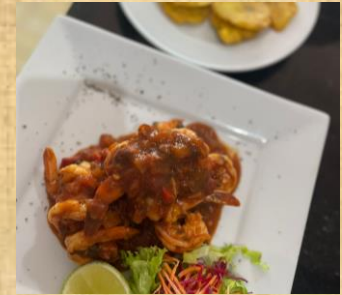
CAMARONES A LA CRIOLLA 900 Shrimp Creole with fried plantains