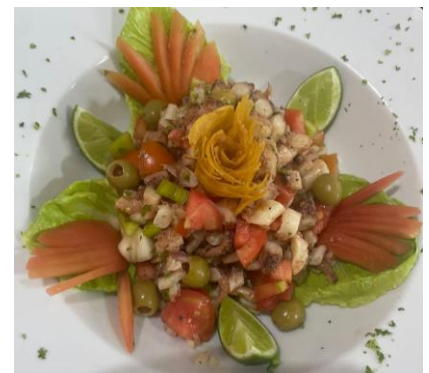
PULPO A LA VINIGRETA 900

All Angus Beef Hotdog with chilly, cheese, ketchup, mustard and diced onions