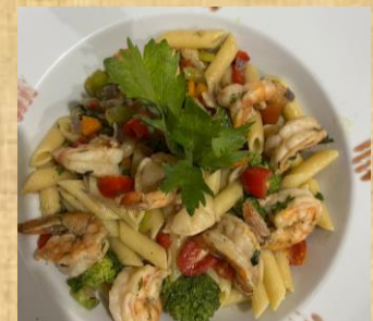
PASTA FRUTOS DEL MAR 2000 NATURAL Seafood Pasta, calamari, mussels, shrimp, salmon natural with no cream sause.