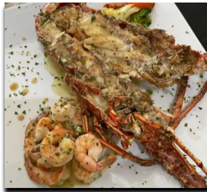
M&A PAREJA DEL MAR 4000

Transport your taste buds to Sosua, Dominican Republic, with our Ajo y Langosta (Garlic and Lobster) dish. Grilled lobster tails, bathed in a garlic-infused butter sauce, capture the essence of Caribbean flavors. Each bite is a celebration of seaside dining, bringing the warmth of the Dominican sun to your palate. Ajo y Langosta is more than a dish—it's a culinary journey, blending the finest ingredients with the coastal charm of Sosua. Immerse yourself in the richness of this experience, where garlic and lobster unite in a symphony of flavors.