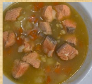
SOPA DE SALMON 800 Salmon soup