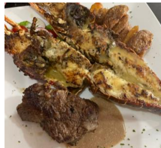
MAR Y TIERRA 4500-6000

Fried Lobster with skirt steak and a chimichurri sauce and steamed vegetables 1.5-4lb