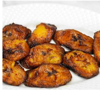
MADUROS 200 Fried sweet plantains