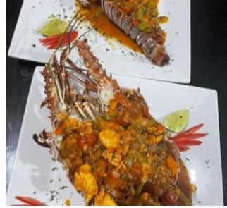
LANGOSTA A LA CRIOLLA 2500-5000

Lobster in a delicious garlic sauce 1.5 – 4lb