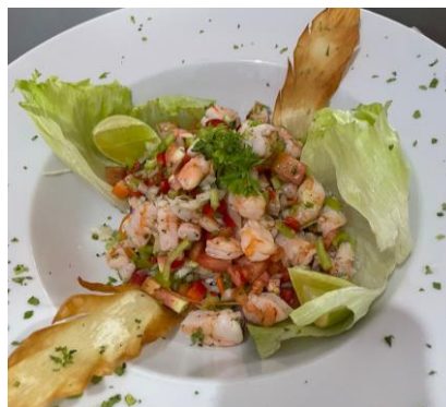
CEVICHE DE CAMARONES 900

All Angus Beef Hotdog with chilly, cheese, ketchup, mustard and diced onions