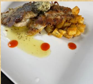
MERO A LA PLANCHA 900 Grilled Grouper with sautéed potatoes