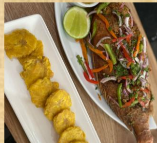
CHILLO FRITO 1000-2900 Red Snapper fried with plantains 1lb – 3lb