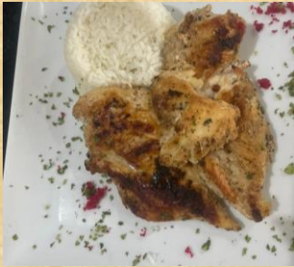
POLLO A LA PLANCHA $600 Grilled chicken with steamed white rice