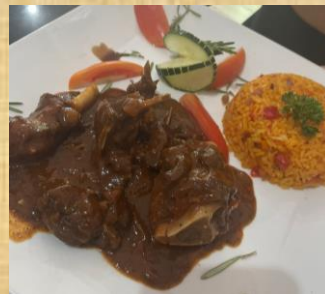
CHIVO GUISADO 1200 Goat stew with yellow rice and vegetables or plantains