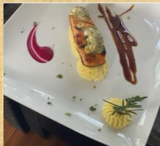
SALMON FINA HIERBA 1100 Grilled salmon with fine herbes and mashed potatoes