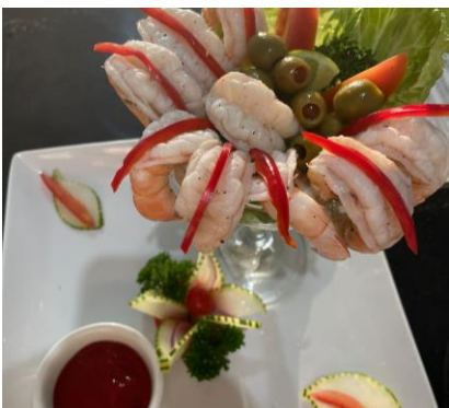
COCTEL DE CAMARONES 700

Cheese, chicken, shrimp or beef empanadas