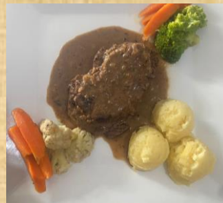
FILETE A LA PIMIENTA 1500 Steak with a pepper sauce. Served with mashed potatoes and steamed vegetables