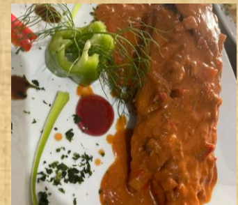
CHILLO AL COCO 1250-3200 Red Snapper Fried or steamed with Samana Style Coconut sauce with white rice or rice and beans "moro" 1lb – 3lb