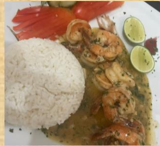
BANDEJA MARISCO 900 Garlic Prawns with steamed rice