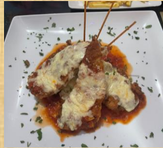
POLLO PARMESAN 800 Chicken Parmesan with your choice of fries, plantains or white rice