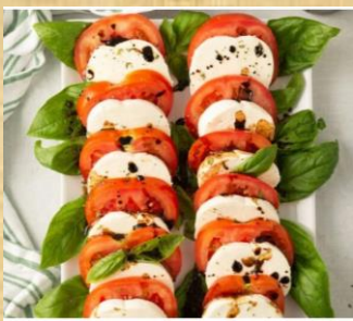
ENSALADA CAPRESE 500 Classic Caprice salad with cheese