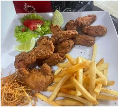
ALITAS (6X) 750

M&A Signature Chicken Wings (BBQ, Buffalo, Lemon Pepper) add fries for 150.