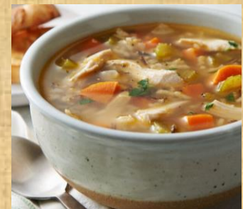
SOPA DE POLLO 650 Classic chicken soup