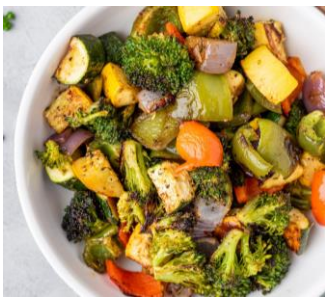
VEGETALES SALTADOS 250 Sauteed or steamed vegetables