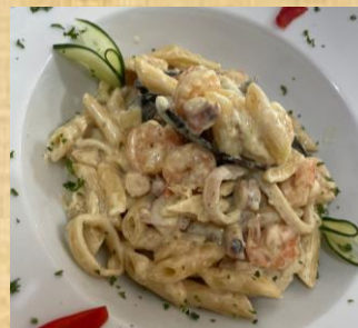
PASTA CON FRUTOS DEL MAR 2000 Seafood Pasta, calamari, mussels, shrimp, salmon