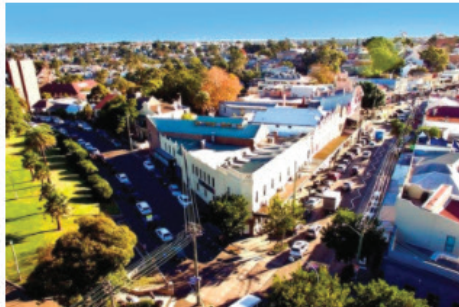
Darling Street, Balmain NSW