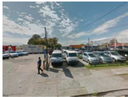
Hume Highway, Lansvale NSW