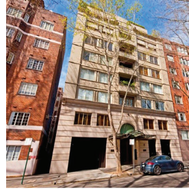
"The Pomeroy" Potts Point