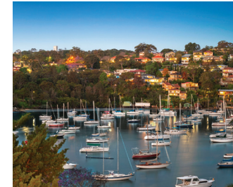
Lucretia Avenue, Longueville