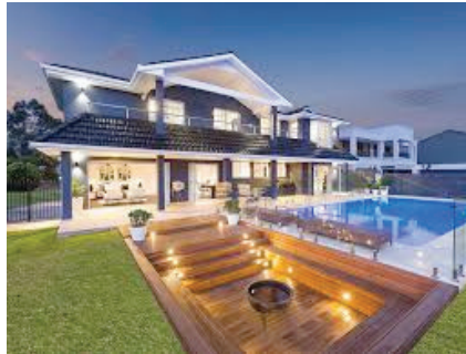
Castlereagh Crescent, Sylvania Waters