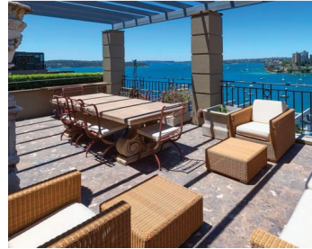
"The Villard" Potts Point