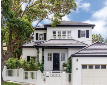
Mitchell Rd, Rose Bay