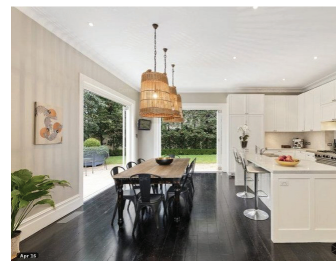
Wellington St Woollahra