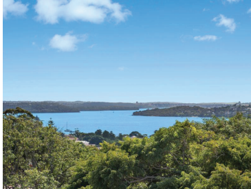
Bundarra Rd, Bellevue Hill