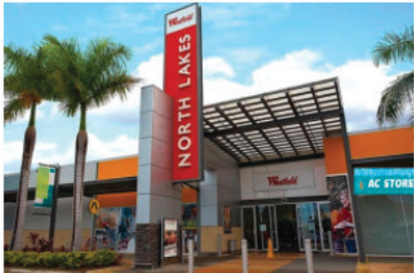
Shopping Centre, North Lakes, QLD