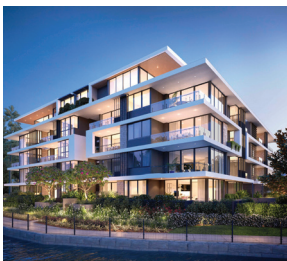
Russell Ave, Dolls Point