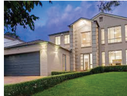
Bella Vista Court, Warriewood