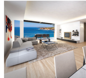
Kenneth St, Tamarama