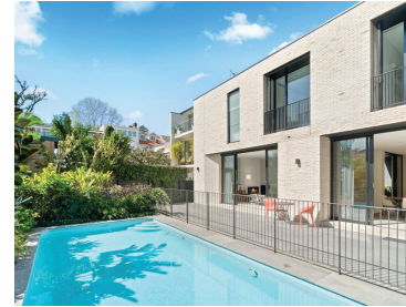
John Street, Woollahra