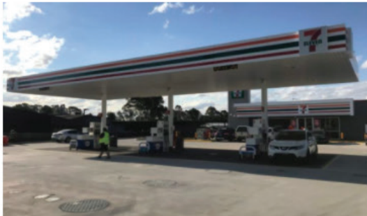
Great Western Highway Werrington NSW