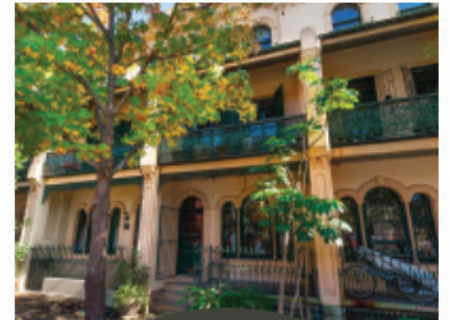
Dowling Street, Woolloomooloo NSW