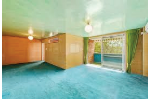
Murray Street, Bronte