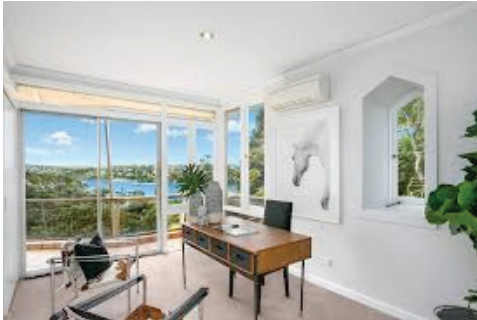
Warringah Road, Mosman