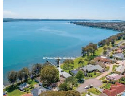
Grand Parade, Bonnells Bay