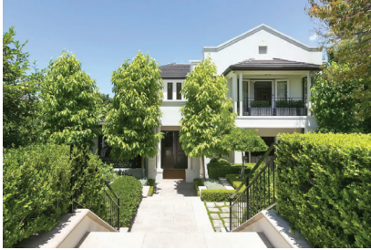
Alexandra St Hunters Hill