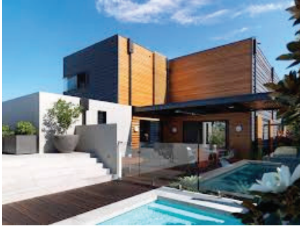
Knox Street, Clovelly