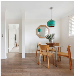
Crown Rd, Queenscliff