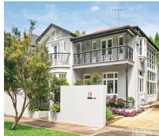
Epping Road, Double Bay