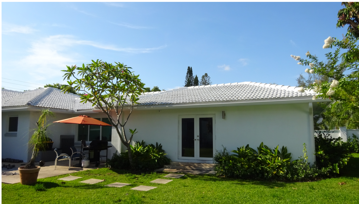
MEDIA / ACTIVITY ROOM ADDITION