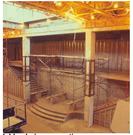
lobby during renovation