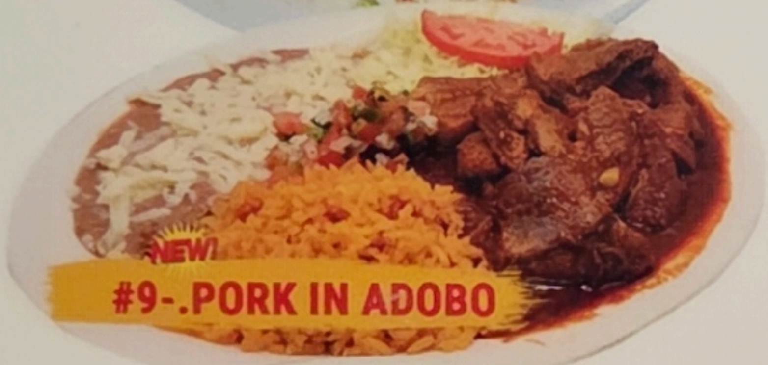
#9-.PORK IN ADOBO