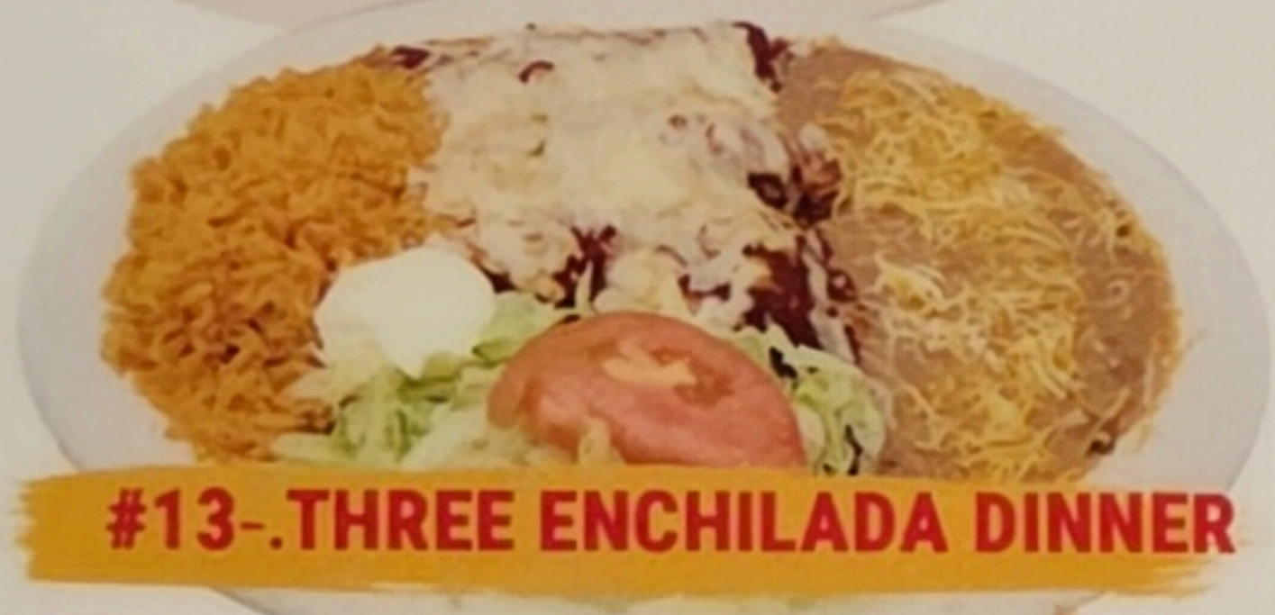
#13-.THREE ENCHILADA DINNER