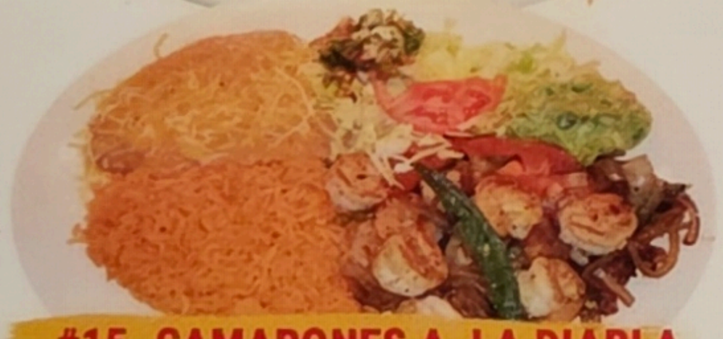
#15-.CAMARONES A LA DIABLA