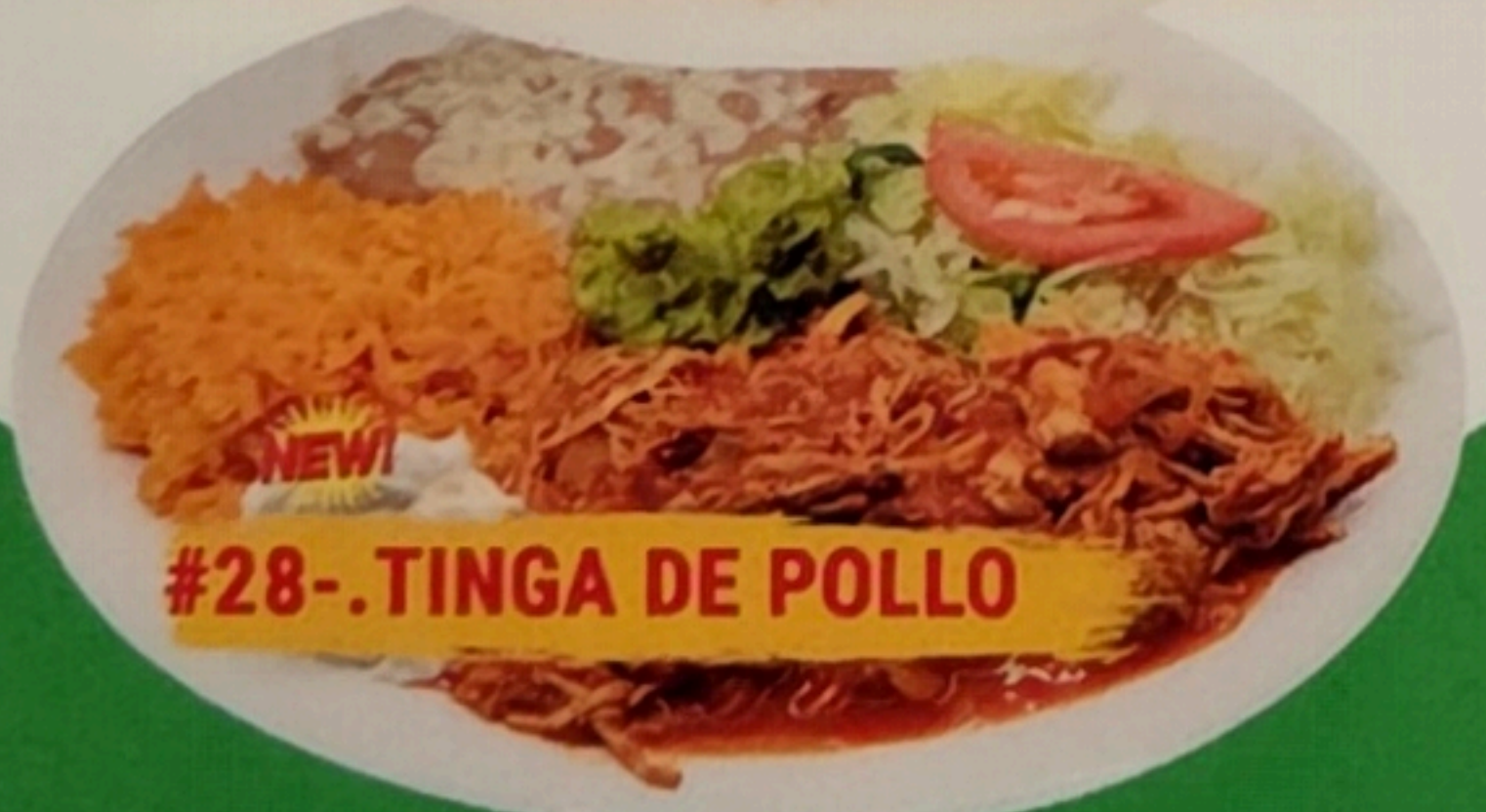
#28-.TINGA DE POLLO