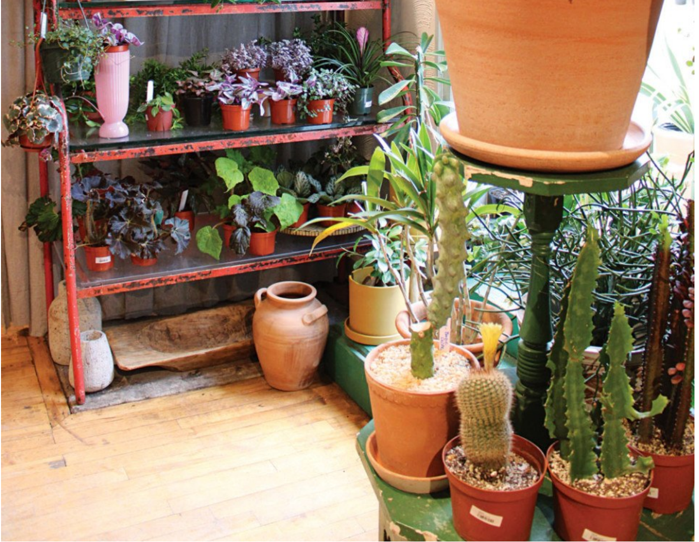
Shades of green at Plant Roots

At first blush, Havertown might seem as suburban as suburbia gets. But to the trained eye, it's a quaint community flush with one-of-a-kind shops, modern dining, and ample greenery. If you have only an afternoon to discover its charms, head straight to Brookline Boulevard. There you'll find Plant Roots , a woman-owned houseplant outpost conveniently connected to ultra-cozy bookstore and java shop the Bookery Coffeehouse . And right across the street sits Novita Boutique , a women's clothing store offering youthfully stylish pieces. Those seeking something indulgent should stop by Centrella's Deli for a hoagie or Koffmeyer's