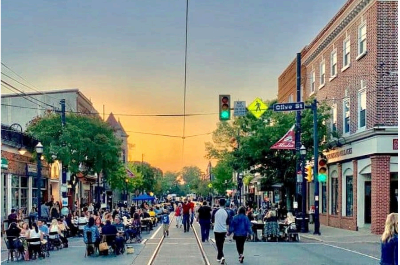
A street scene in Media