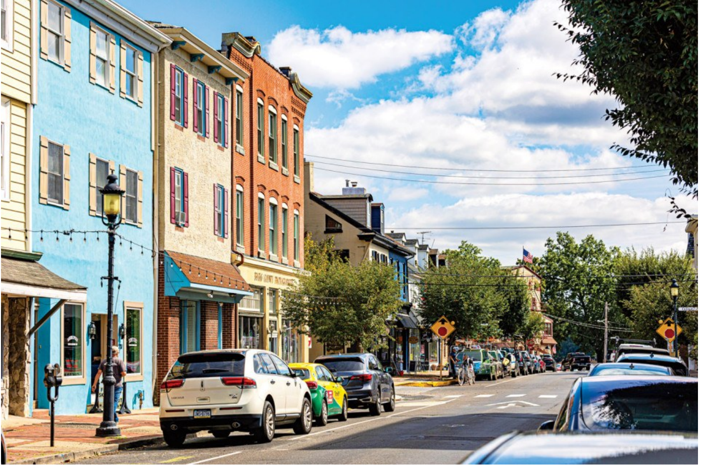
Bristol