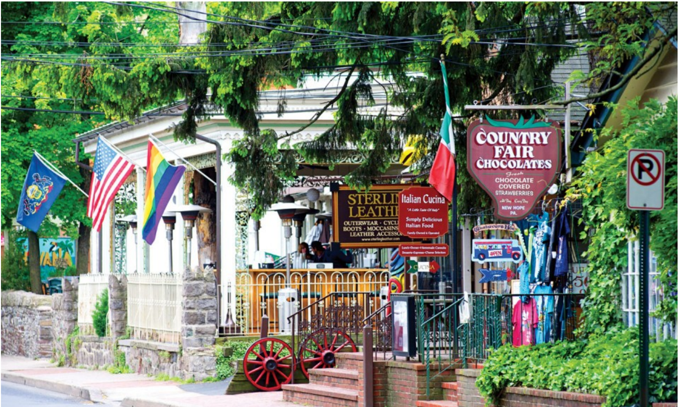
Storefronts in New Hope

Flock like an A-lister to this artsy Bucks County enclave, now a destination for the well-heeled — and the super-famous. (Residents include Bradley Cooper and the Hadids; Leonardo DiCaprio and the Biebers have been recently spotted ambling down the streets.) While you can make this a day trip, we suggest staying the weekend to really live the high life. Stay at the ritzy River House at Odette's (rooms from $199), a riverside hotel with a great restaurant (go here for brunch), piano lounge, and private rooftop bar. Tip: Make use of the hotel's free bike rentals and take a ride along New