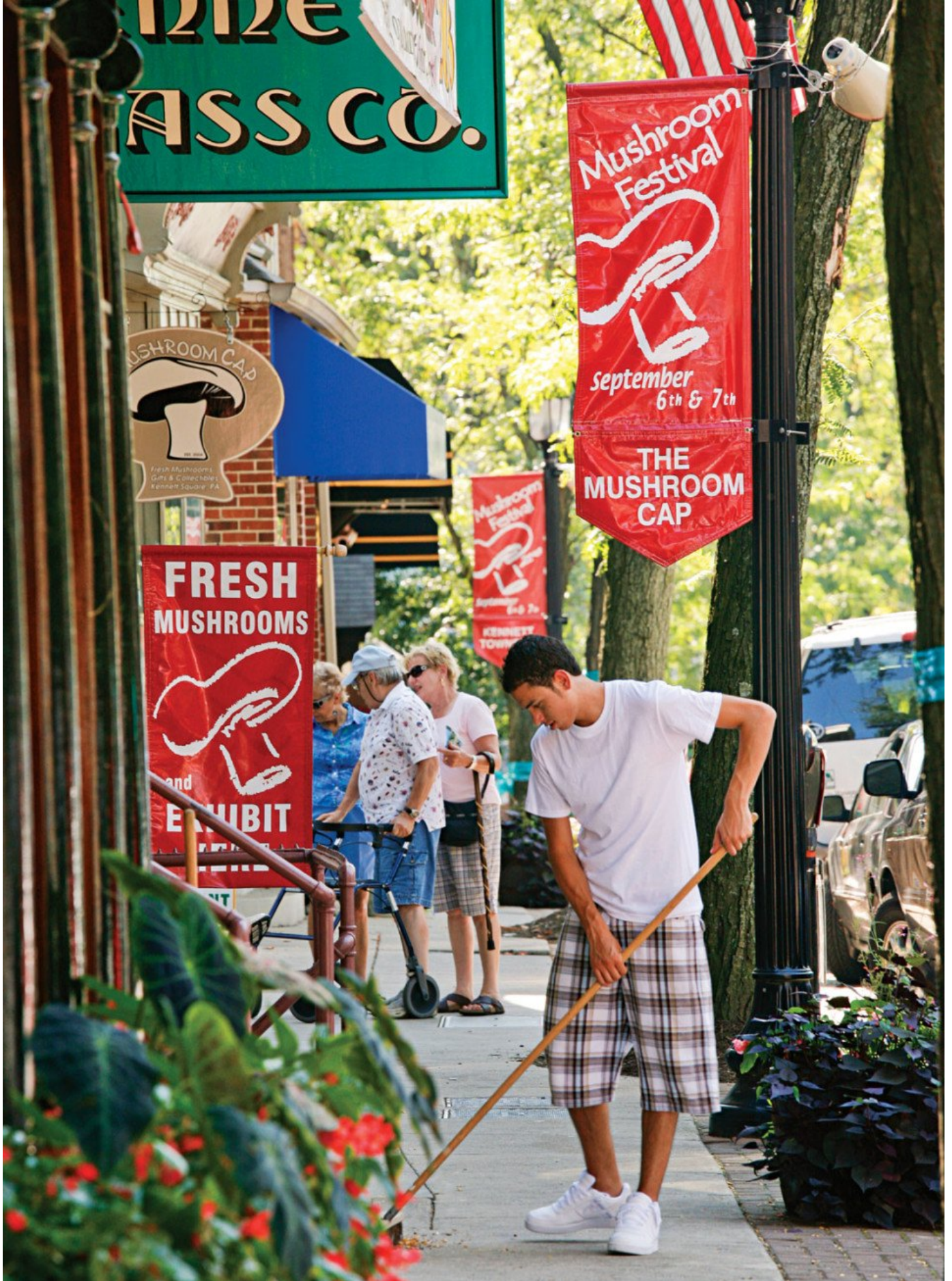
State Street in Kennett Square