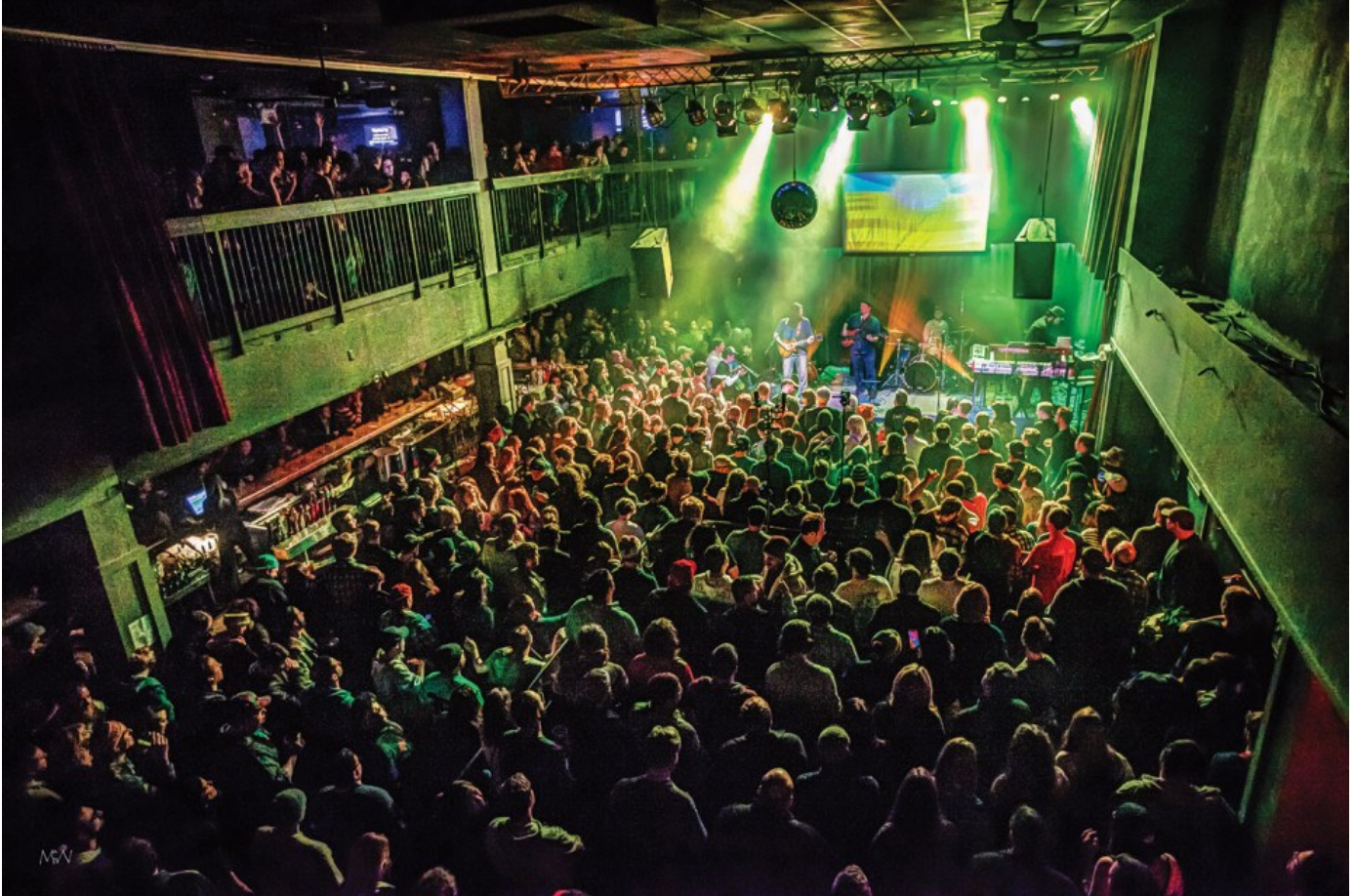
A packed house at Ardmore Music Hall