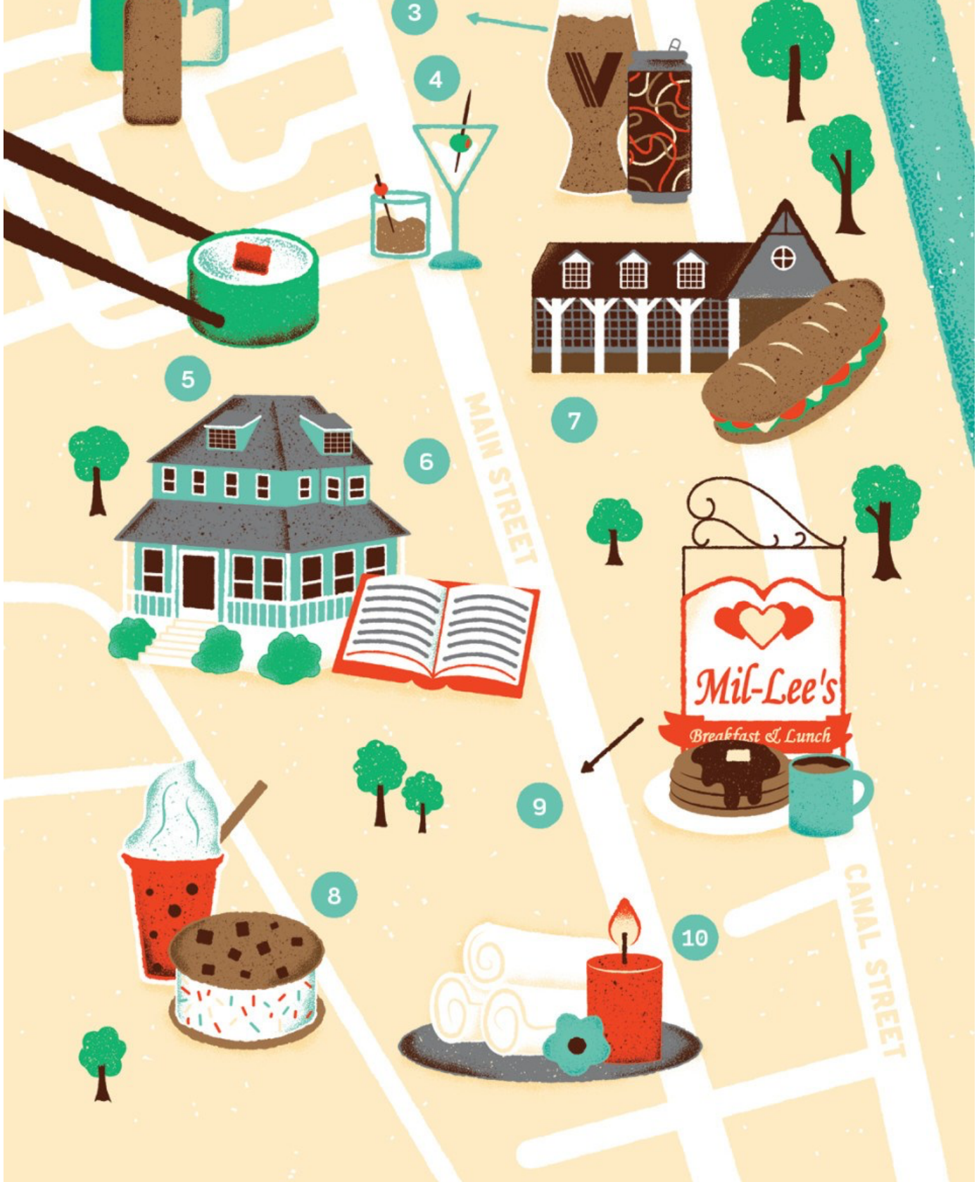
Yardley / Map illustration by James Olstein