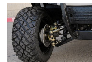
DOUBLE WISHBONE INDEPENDENT SUSPENSION