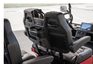
SEAT BACK CUP HOLDERS & HAND RAIL