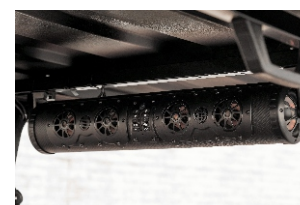
TOP NOTCH SOUND BAR