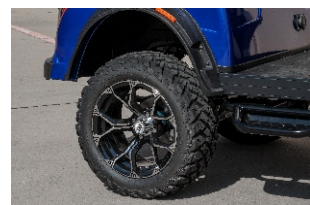
14 INCH WHEEL RIMS