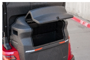
MEGA SIZE REMOVABLE TRUNK