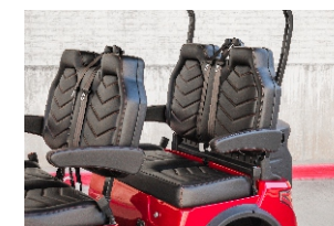
HIGH QUALITY SEATS WITH 3-POINT SEAT BELTS