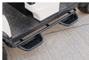
HEAVY DUTY RUNNING BOARD