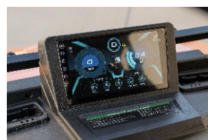
MULTI-FUNCTIONAL TOUCHSCREEN LCD