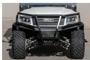
HEAVY DUTY BRUSH GUARD

More features can be found , visit our website for details.