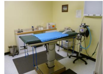
LSAH Surgery Suite

As pet owners we are all concerned about the risks associated with anesthesia and surgery. Anesthesia and surgery is a more exact science than you might expect. The safety of general anesthesia is dependent upon the anesthesia agent, equipment used, the methods of patient monitoring, patient status and the expertise of the people involved. The safety of general anesthesia is dramatically improved by giving adequate attention to each of these areas.