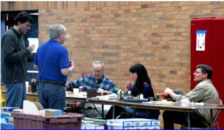
Isn't there anything you can do to help us?