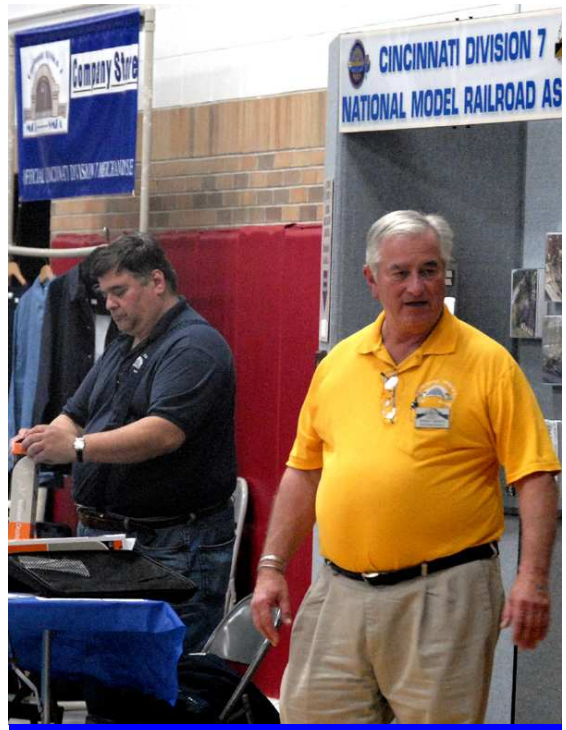
Are you sure the door's open?