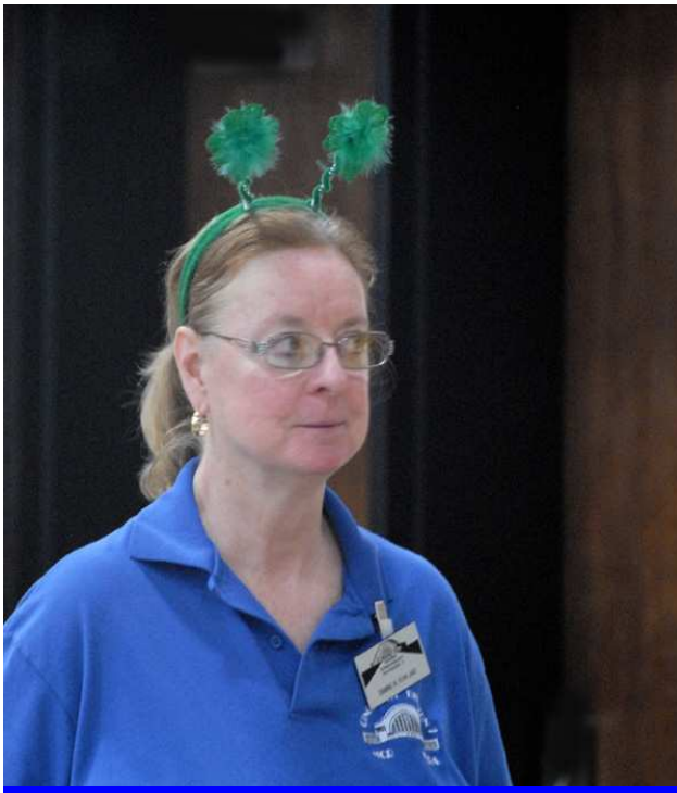
Only five and a half hours to go.