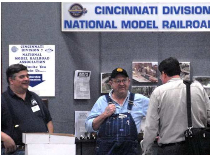
Yep, were the official greeters!