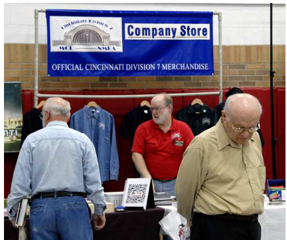
What, we sold out already?