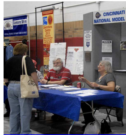
And you get the Oil Can too!