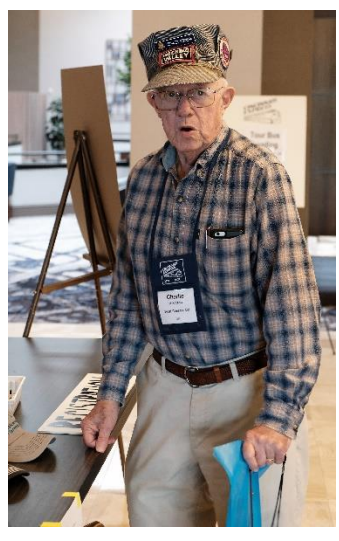
At our 2018 MCR Convention