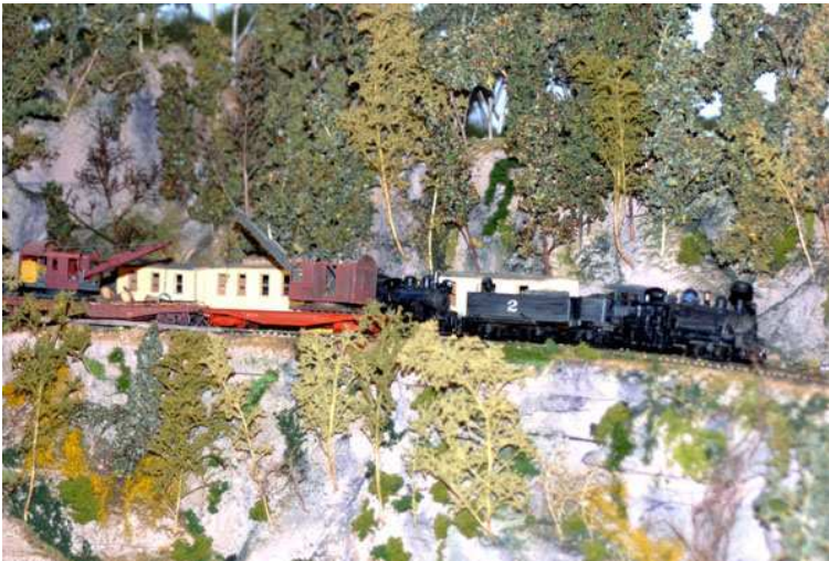
Frank Fieler's Layout