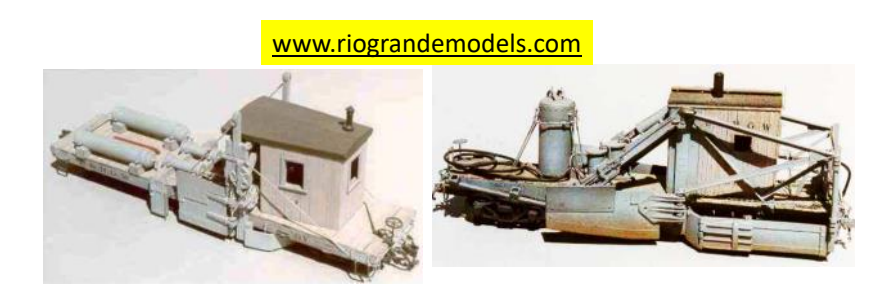
Rio Grande models are produced using white metal castings, injected plastic castings, scale wood, etched brass and other parts to give a most accurate model.