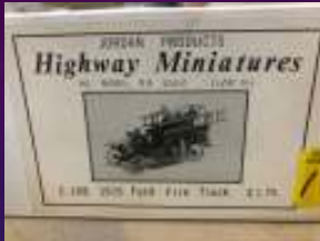
Jordan 1915 Ford