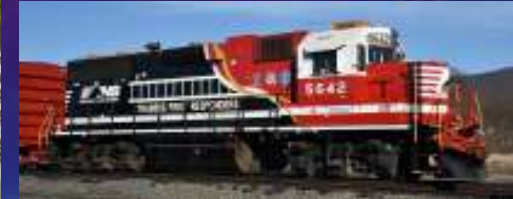
HO: Atlas, Athearn Roundhouse