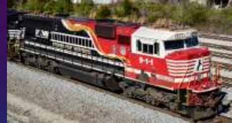
HO: Genesis N: Atlas