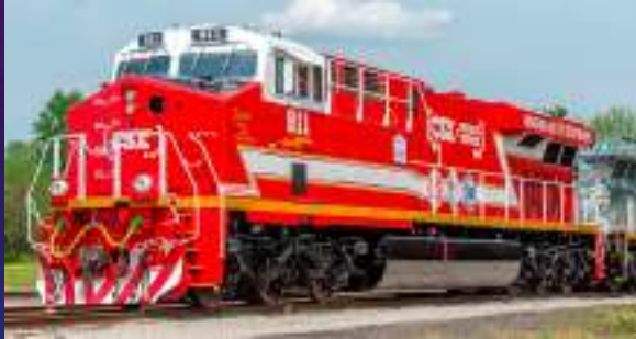
HO: BLI, ScaleTrains