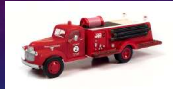
CMW 1941-46 Chevrolet