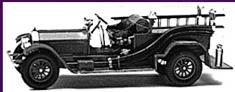
Jordan 1927 Ahrens Fox