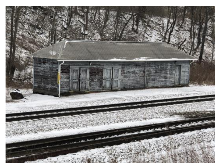
Close up of Section House