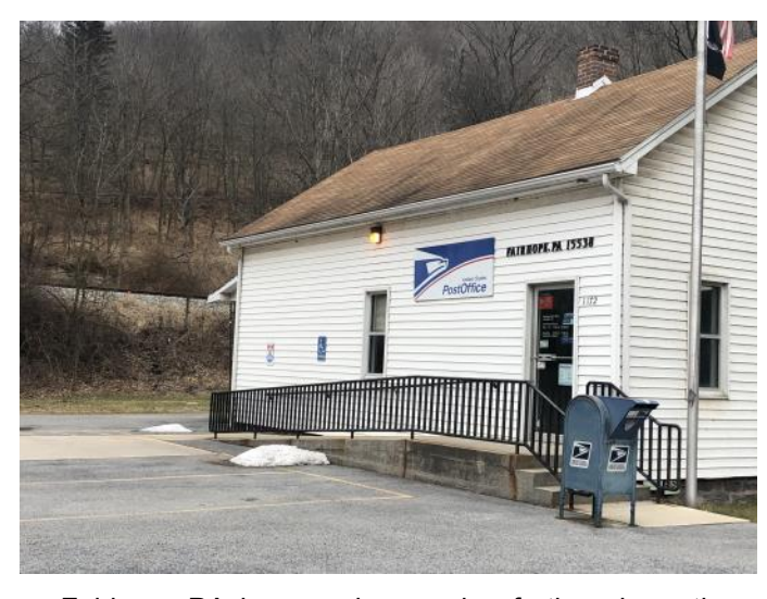
Fairhope PA is a grade crossing farther down the eastern slope. Modeling a building with a name on it can help "place" a location