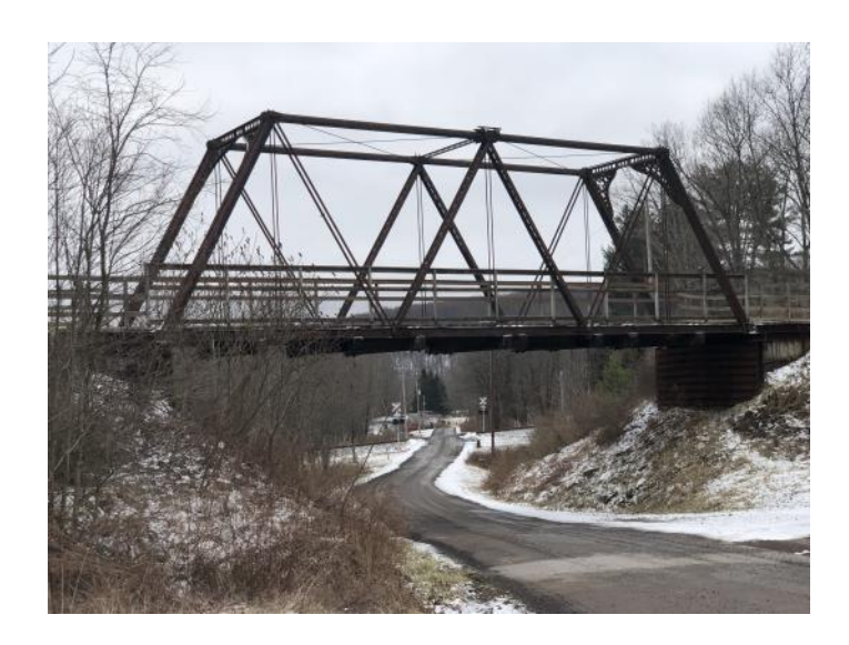
The neat little truss bridge is actually the ex-Western Maryland (now a bike path), the B&O is the line in the distance. This is heading up from Meyersdale PA to the tunnel.