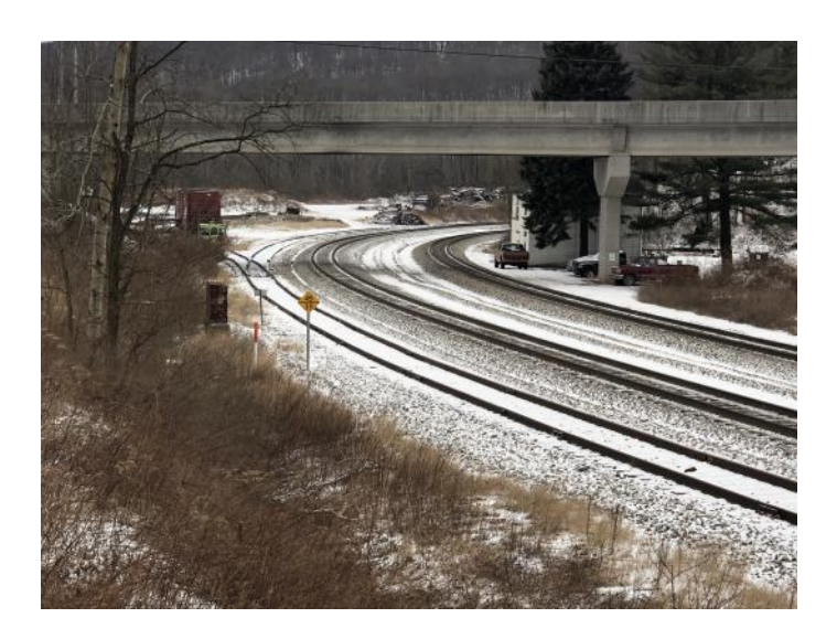
Looking west at Sandpatch